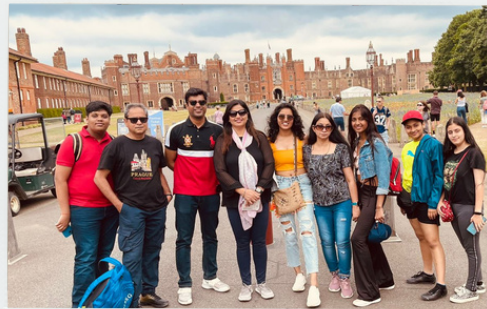
Hampton Court Palace