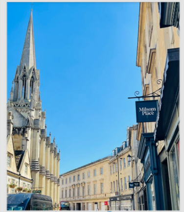
City of Bath