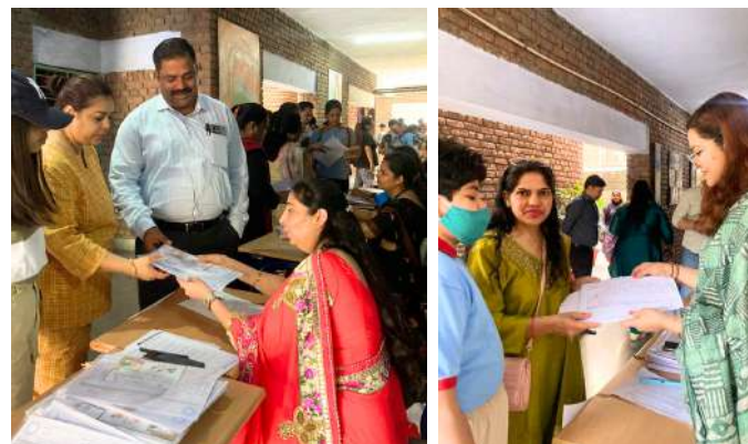
Report card distribution and insightful discussions between parents and teachers

Ghaziabad: The Open House for Grades 6 to 9 was successfully organized on March 28, 2025 (Friday), at Delhi Public School Ghaziabad Meerut Road. Parents and teachers engaged in meaningful discussions about students' academic progress, strengths, and areas for improvement, along with report card distribution. Alongside the Open House, a Books Donation Drive was also conducted to encourage parents and students to donate educational resources for underprivileged children. The Open House successfully fostered a strong parent-teacher partnership.