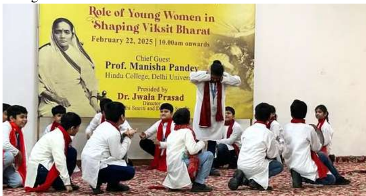
Empowering change through theatre

Ghaziabad: On her 81st death anniversary, Grade 4 PYP Learners of DPSG Meerut Road paid tribute to Kasturbha Gandhi at Gandhi Darshan, Rajghat through the Conclave on 'Role of Young Women in Shaping Viksit Bharat 2047', organized by Gandhi Smriti and Darshan Samiti, Ministry of Culture. The talented young artists took centre stage with their Nukkad Natak 'UDAAN', powerfully showcasing the role of young women in building a progressive India. The event also featured insightful Town Hall discussions, institution-led stalls, and inspiring street plays—all reinforcing the vision of an empowered future led by women. It was a day of learning, inspiration and a promise for a change.