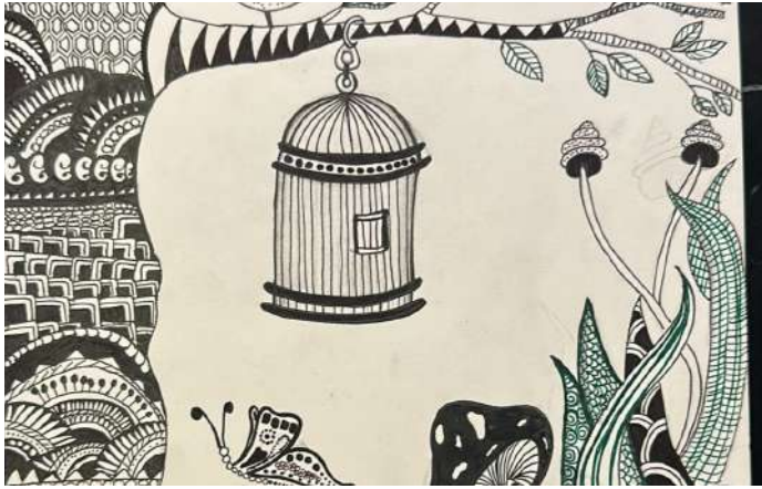
-ISHI AGARWAL 5-B