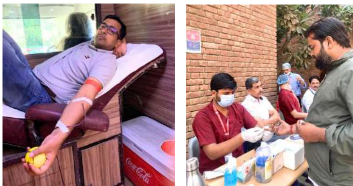
Compassion in action, saving lives together.

Ghaziabad: DPSG MR, in collaboration with Rotary Club Ghaziabad North, hosted a successful blood donation camp on March 28, 2025. The event saw enthusiastic participation from parents, alumni, and staff, making it a resounding success. Donating blood is a safe and healthy practice that is one of the most effective ways to support others in need. This develops a sense of compassion and care for others.