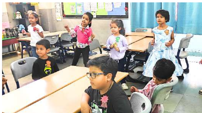
Welcoming new students through engaging performances.

Ghaziabad: To acquaint the new learners with the school, DPSG MR organised an Adaptation programme. The programme encouraged the inclusion of all students by addressing individual learning styles, needs and promoted diversity within the school environments. The students enjoyed the acts performed by their teachers which kept them captivated and enthralled during the event