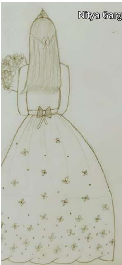
-ISHANI GARG 5G