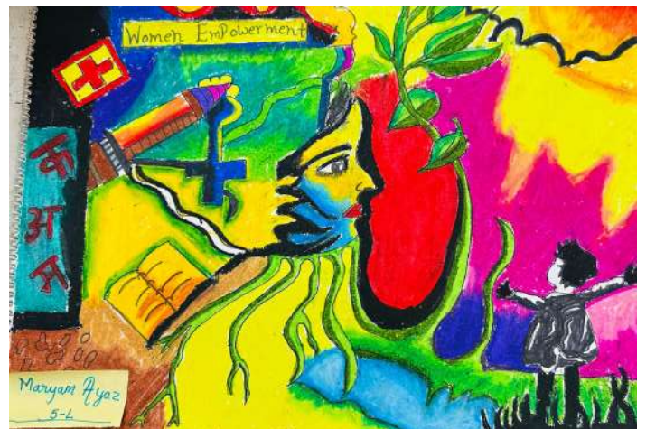
-MARYAM AYAZ 5-L