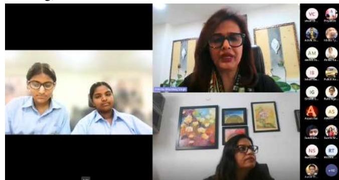
The enthralling online orientation programme

Ghaziabad: Student-led online programmes were successfully conducted by the school for parents of students transitioning from Grade 5 to 6, Grade 6 to 7, Grade 7 to 8, and Grade 9 to 10. It provided insights into the past year's events and achievements while acquainting new parents with the assessment policy, School Health Programme, community engagement initiatives, blended learning, and the Parent Connect Portal.