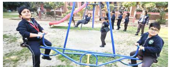
Children happily swinging, enjoying the thrill and laughter of playtime