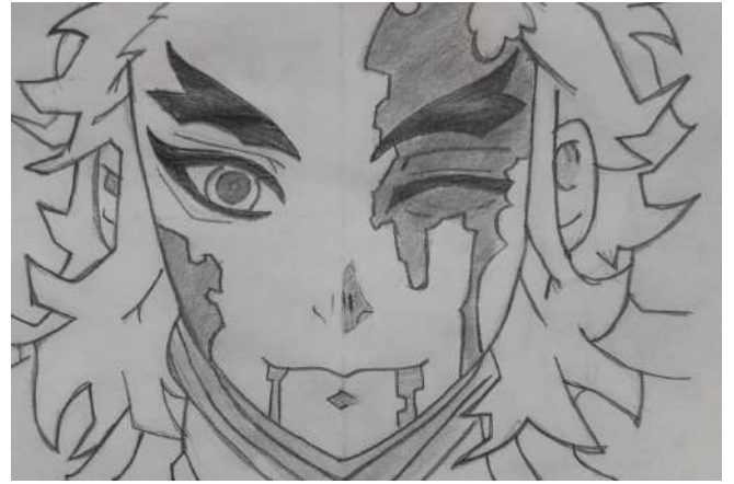
-PADMESH GUPTA 4-H