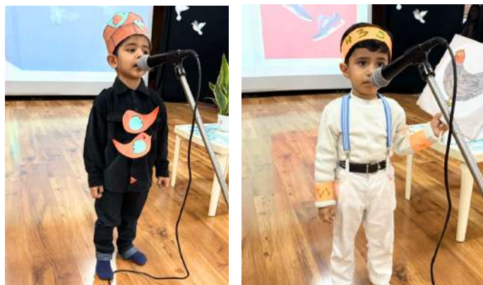
Young storytellers captivating the stage with their expressions

Ghaziabad: Solo stage performances provided a wonderful platform for the young learners of Pre-Nursery to showcase their talents and build confidence. They expressed themselves beautifully through rhythmic poems, developing essential communication and public speaking skills. The combination of voice modulation, facial expressions, and body language brought their poetry to life in a creative and engaging way. These performances not only nurtured their artistic expression but also encouraged self-confidence and stage presence, paving the way for future learning and growth.