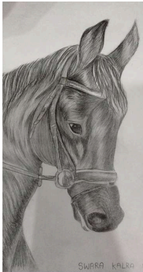
-SWARA KALRA 5F