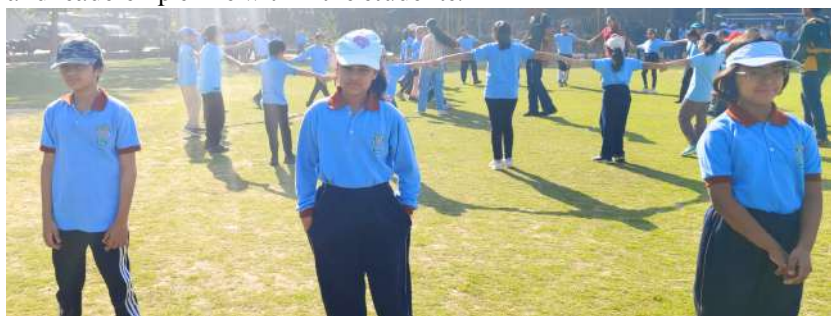
Exploring new heights of adventure and teamwork at DPSG MR!

Ghaziabad: The Adventure Camp at DPSG MR was a wonderful opportunity for the students of Grades 3, 4 and 5 to explore their sense of adventure and extend themselves beyond what they considered themselves capable of. The school playground transformed into an adventure zone with various special activities such as ziplining, tug of war, commando net climbing, Burma Bridge many more. These activities were conducted in completely safe and controlled environments and were targeted at developing team spirit, confidence, perseverance, and leadership skills within the students.