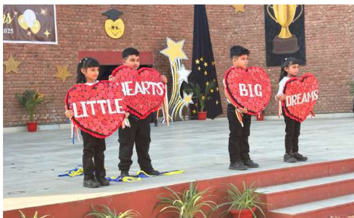
Celebrating the bright beginnings of our DPSG MR Starz tinytots

Ghaziabad: The enthusiastic learners of the Starz Wing stood together in a moment of sheer joy and pride to honour Kindergarten graduates. The little masters of grade KG have blossomed beautifully, achieving remarkable milestones along the way. They enjoyed a journey from being mother's little child evolving into confident IB learners, with a profile, attitude, essential skills, and competencies. Their hard work and enthusiasm have truly set a strong foundation for their future learning adventures. Let's congratulate them for their new beginning with endless possibilities.