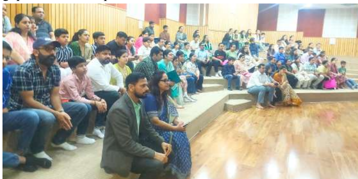
The offline orientation programme was a total success

The interactive & informative session effectively bridged the gap between new parents and the school.