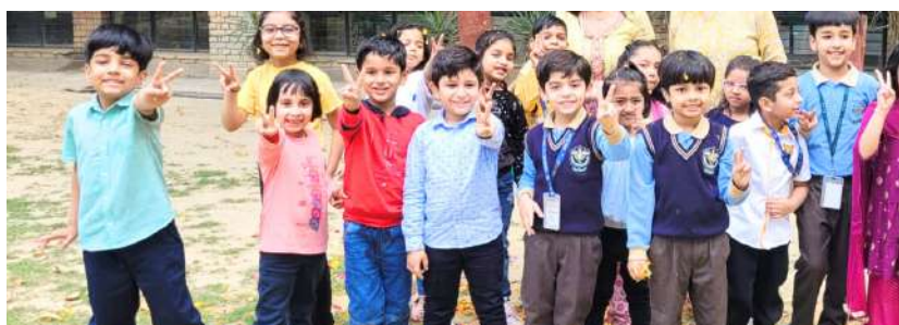
Colors of Joy: Kindergarteners Celebrate Holi with Laughter and Cheer!

Ghaziabad: Holi brought joy to DPSG Starz like blooming flowers, painting the world in vibrant hues of love, happiness, and unity. The festival of colors was not just a celebration; it was a beautiful expression of togetherness, a time when hearts united, and laughter echoed through the air. As bright gulal swirled through the breeze, children and teachers immersed themselves in the spirit of the festival, their faces adorned with radiant smiles. The air was filled with cheerful voices, the sound of playful splashes, creating a symphony of joy that lingered in every heart. More than just a playful exchange of colors, Holi at DPSG Starz became a reflection of nature's beauty, a tribute to the blossoms that surrounded them and the renewal that spring brought. It was a time to spread kindness, embrace friendships, and celebrate the diversity that made each color even more meaningful.