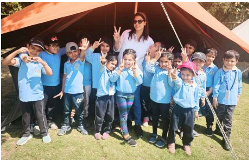
Starz learners enjoying the Adventure Camp

Ghaziabad: IB learners of the Starz Wing leapt into challenges, conquered fears and soared with confidence while enjoying the Adventure Camp. The great outdoors became the ultimate classrooms, fueling creativity and grit. Every moment of the event sparked curiosity and leadership qualities within the little champions of the Starz Wing.