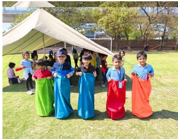
Grades 1 & 2 students sack racing in the Adventure Camp

Ghaziabad: DPSG Meerut Road's excited learners of Grade 1 and 2 embarked on an action-packed adventure camp. The event was filled with thrilling activities like tube wrestling, sack race, obstacle course and other team-building games. The students discovered strengths within themselves, built new friendships and created lifelong memories, making it an unforgettable experience.