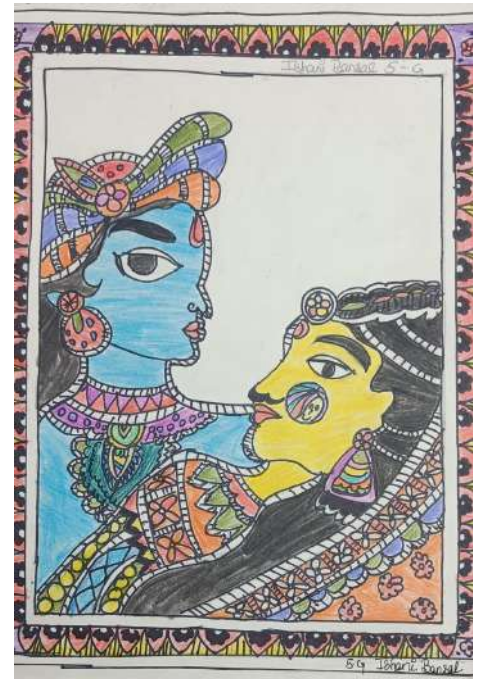
-NITYA GARG 4J