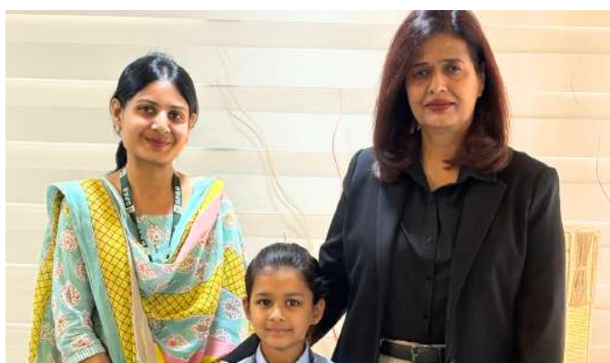
DPSG's brightest minds reach for the stars with ISRO Internship