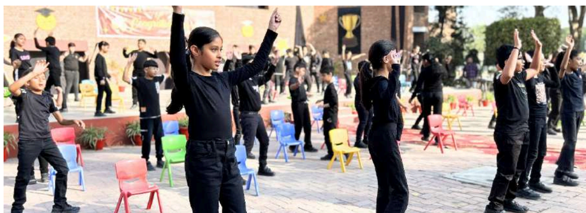
Celebrating the accomplishments and bright futures of Grade 5 graduates at DPSG Meerut Road: A day of pride, resilience, and new beginnings