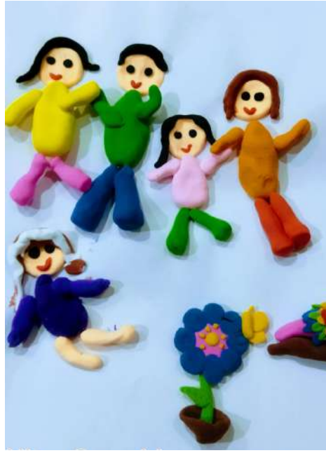
-NITYA GARG 4J