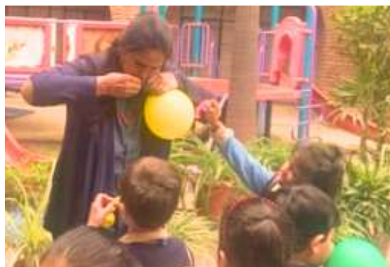
Young Minds Explore Science Through Fun Experiments!

Ghaziabad: The kindergarten scientists celebrated Science Day with fun-filled experiments and activities in the Primary Wing science park. As curiosity filled the classrooms, children engaged in hands-on experiences, blending fun with discovery. Each experiment became a stepping stone towards growth and arose a spark of understanding in the minds of young children.