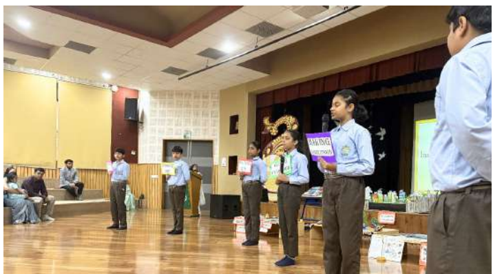
Students giving an overview of the subjects and engagements of the year ahead

Ghaziabad: On 26th March 2025, an orientation programme was conducted for the new parents of students of Grades 1-5. It was an excellent opportunity for the parents to get to know about the activities of the school and to create a bond with the teachers as the school is a home away from home for their wards. The parents were briefed about the rules and regulations of the school. From showcasing projects to setting exciting goals for the future, the PYP Learners' dedication and enthusiasm were truly inspiring. The session gave the parents an idea of the curriculum which is self-directed with hands-on learning activities.