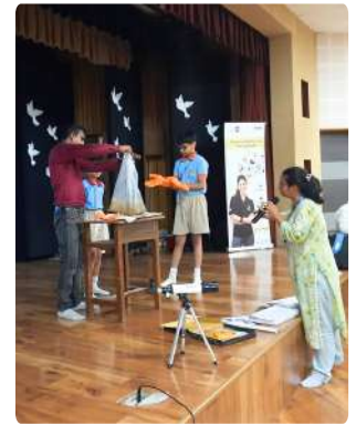
Grade 5 students exploring space science with excitement.