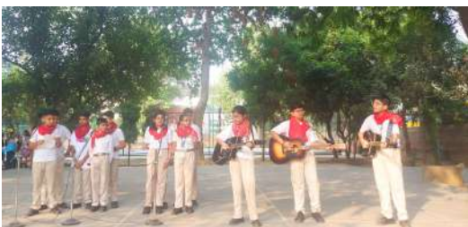
Language and Culture Unite: Secondary Wing's Vibrant Assembly Celebration!