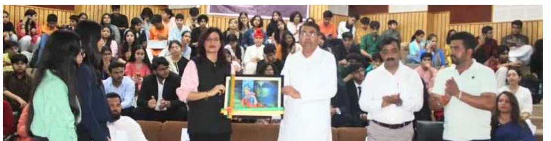
Global issues tackled at DPSG MUN conference