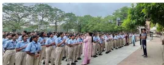
Leading the charge against tobacco: DPSG MRD students in action.