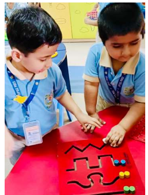
Hands-on learning and creativity thrive at DPSG's ACTIVIA!