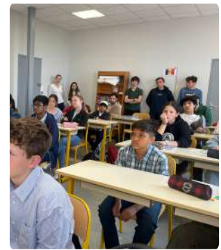
Exploring France: DPSG MRD Students Embrace Cultural Journey