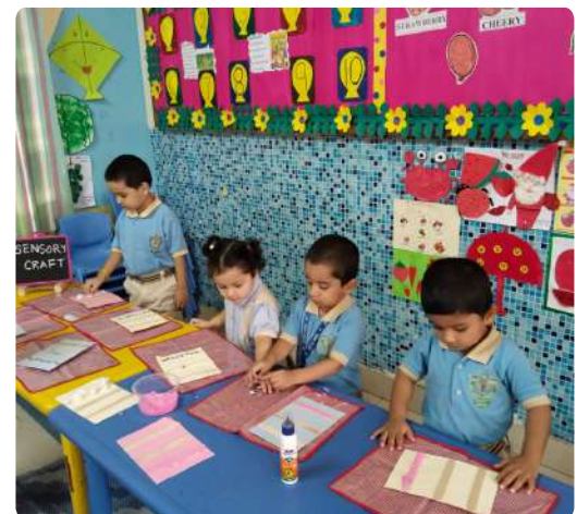
Where creativity meets curiosity!

Ghaziabad: Behind every splatter of finger paint and every handful of gooey slime lies a world of sensory discovery and cognitive growth. Messy play isn't just about making a mess; it's about unlocking the full potential of child's imagination and laying the groundwork for a lifetime of learning. DPSG's youngest brigade had a fantastic way to engage their senses and foster creativity through a wonderful engagement