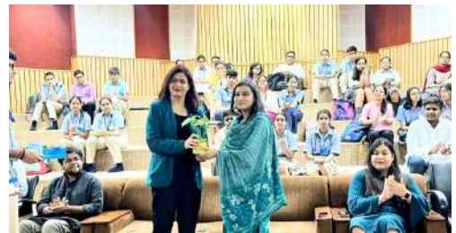
Debate heats up at DPSG as students dissect the digital divide's role in shaping global equality.