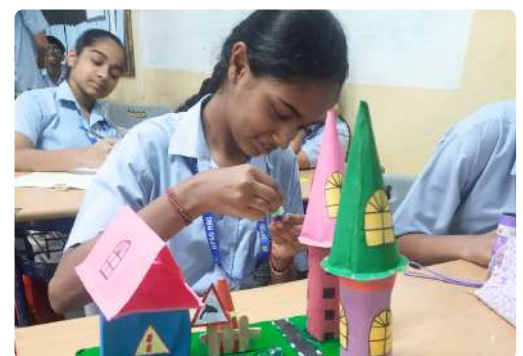
DPSG MRD celebrates Mathematics week with enthusiasm and energy.

Ghaziabad: The Mathematics Week was a celebration of creativity and talent, and the students of grades 6-10 participated in engaging activities such as Mosaic Art, Tessellations, Geometric City Dioramas, and Coordinate Geometry Face Masks. They explored, created and embraced mathematical wonder, making it a week filled with imaginative learning and exciting discoveries.