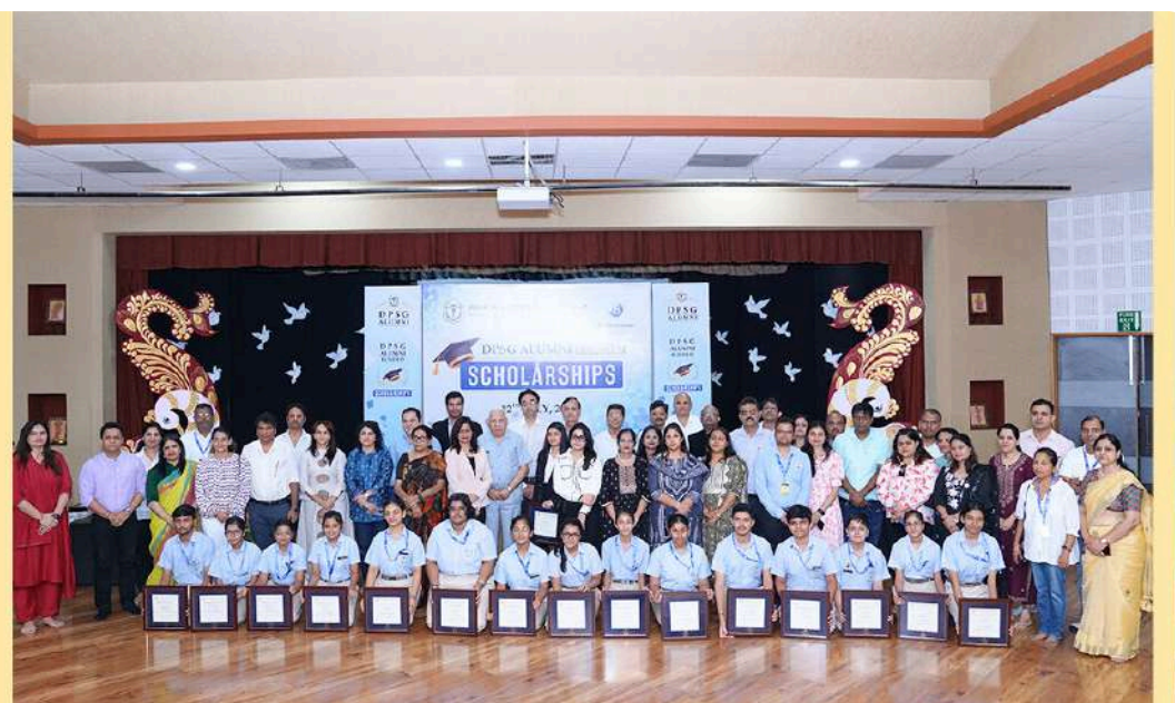
DPSG Alumni Funded Scholarship Ceremony: Giving back to the future torchbearers

Splash pool is to provide learners with fun, sensory-rich experience that promotes physical activity, social interaction, and learning through play. Bubbling and splashing water, the learners enjoyed a lot.