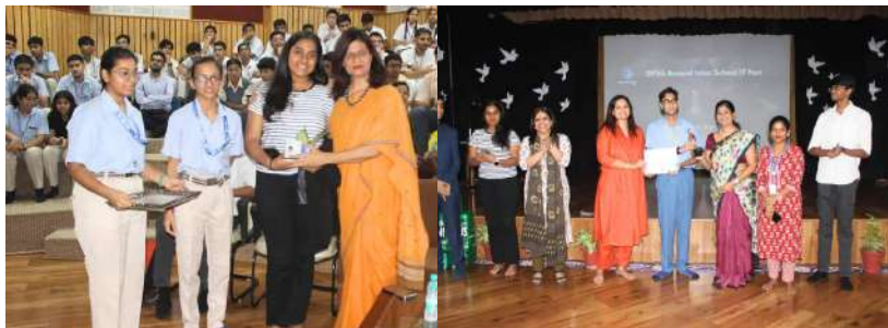
Tech talent shines at DPSG's Infinitius!