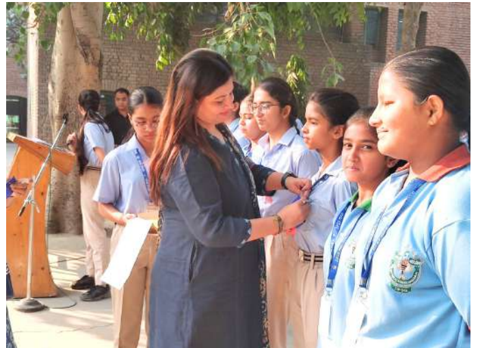
Raising awareness with the Jal Doot Campaign—students pledge to conserve water.

Ghaziabad: The students of grade 10 organized a special assembly introducing the Jal Doot Campaign which aimed at promoting water conservation. The assembly highlighted various methods to save water and the participants pledged to adopt these practices. This initiative aims to create a more environmentally conscious community.