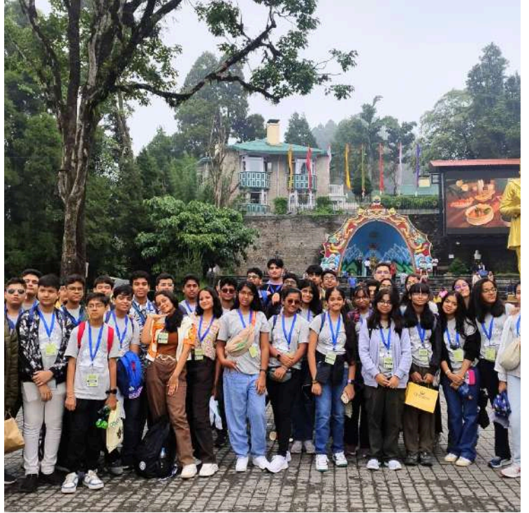
A voyage of learning and adventure : German Youth Camp in Kalimpong