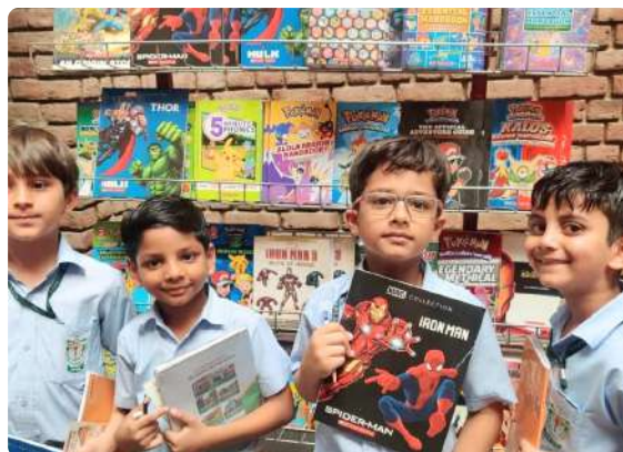
Learners in a vast pool of books!

Ghaziabad: DPSG MRD hosted a week-long book fair, attracting book lovers of all ages. The event showcased a diverse range of titles, from fiction to non-fiction, classics to contemporary bestsellers. Learners enthusiastically explored the fair, discovering new authors and genres, and gained valuable insights, developed critical thinking, and expanded their vocabulary. The fair also highlighted the importance of reading in today's digital age, encouraging learners to explore beyond screens.