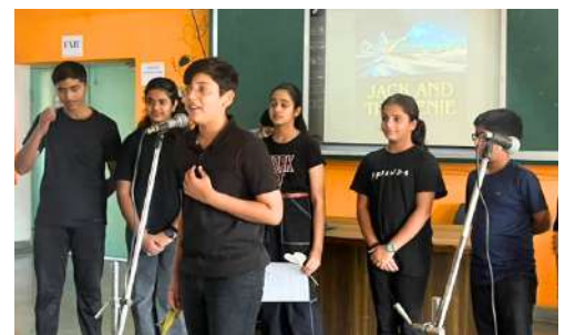
Literary Fiesta: DPSGMR celebrates English week with zeal and zest.

English Week was a phenomenal success, fostering a love for literature, communication, and teamwork.