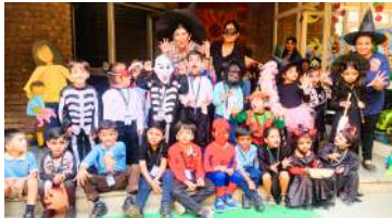
HALLOWEEN: Students at DPSGMR celebrated Halloween dressing up as spooky characters.