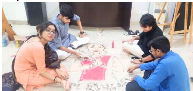
Creativity Unleashed: IBDP Learners Shine in Rangoli and Bandhanwar Competition.

Ghaziabad: An Interhouse Rangoli and Bandhanwar Making competition was organized for the learners of IBDP in the festive season of Deepawali. The students unleashed their artistic aptitude and creativity by using paints and flowers to create innovative Rangoli designs and bandhanwars. The colorful and eye-catching decorations that incorporated intricate handcrafted designs made it a visual treat for all who visited the IB wing.