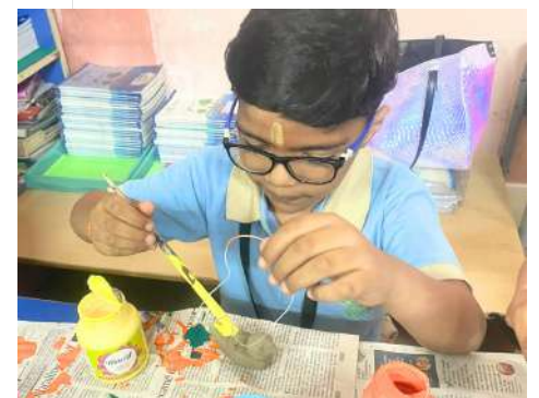
DPSG Starz Soars: Creative Talents Illuminate Sculpture Exhibition.