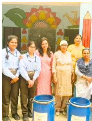
Interact Club Shines: Shares the light and sparkle with generosity.