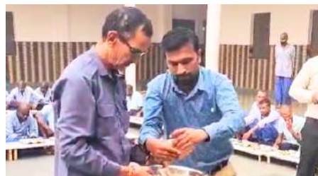
Interact Club Shines: Spreads Diwali joy and illuminates hearts!