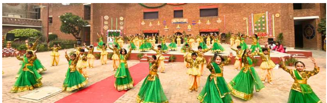
Grade 2 Celebrates Diwali: A Cultural Extravaganza Sparkling with Traditions.