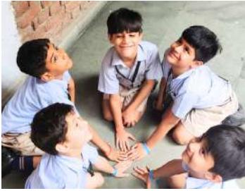
CHILDHOOD: Childhood is the kingdom of happiness.