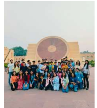
Discovering history and culture: Grades 6-8 explore Neemrana- Jaipur!