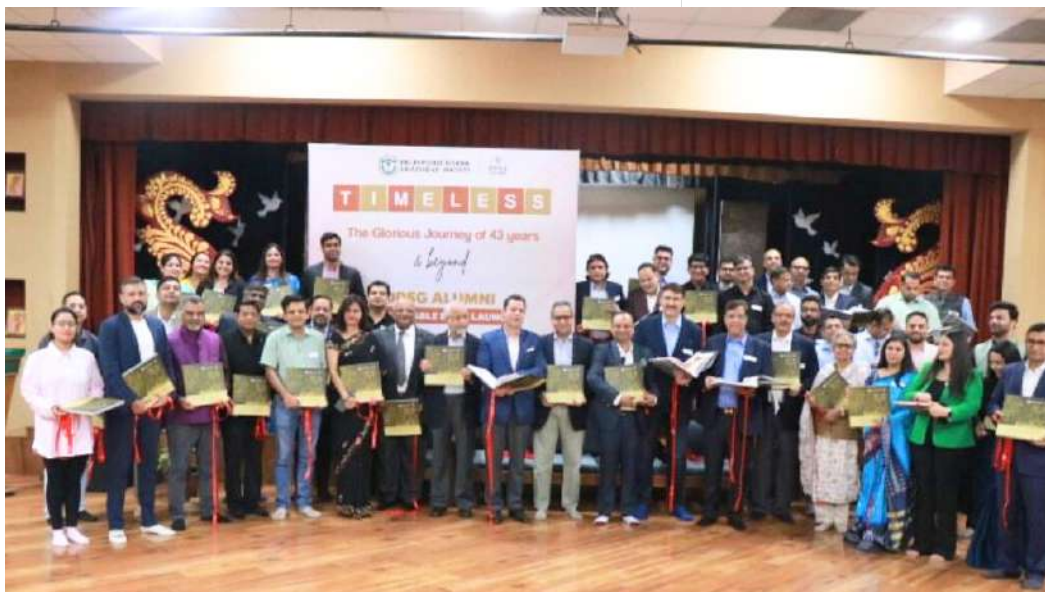
T.I.M.E.L.E.S.S. Launch: The DPSG Alumni Coffee Table Book bringing memories back to life.