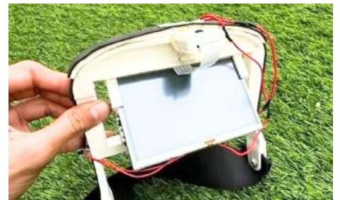
DPSG's STEM Trailblazers: Selected for India STEM Summit 2023, Showcasing Innovative Brilliance.