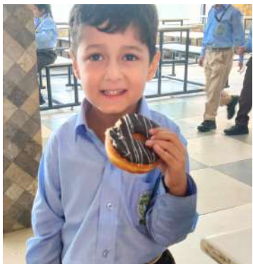
Nourishing Smiles, One Delicious Bite at a Time – School Canteen Delight!