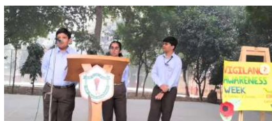
Embarking on Ethics: Class IX Unveils Values in Special Assembly.