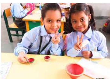
FRIENDS FOREVER: School Friendships are timeless.

GURUPURAB : The spiritual ambience of the devotional chants were attended by all the students.