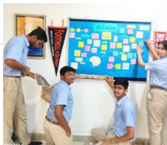
Creativity meets teamwork as IBDP learners participate in Board Decoration.

Ghaziabad: The Board Decoration competition at IBDP wing was a vibrant and creative event that brought to light the latent talents of IBDP learners. The competition aimed to foster creativity and teamwork, and served as a platform for students to showcase their artistic skills and build a sense of camaraderie amongst the learners.