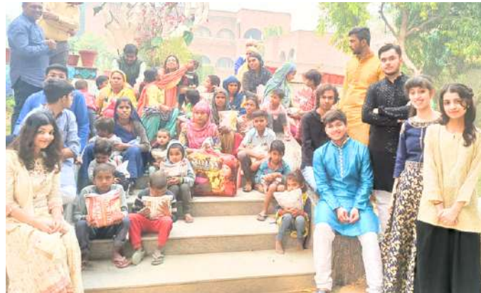
Donation Drive: DP I and DP II learners celebrate Dilwali Diwali