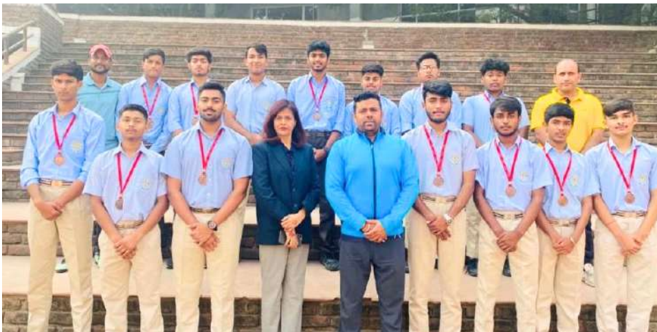
Football Glory: Boys Football Team clinches CBSE Clusters 2nd Runner-Up Title with Skill!

Ghaziabad: The DPSGMR Boys Football Team in the CBSE Cluster XIX U-19 Boys Football Tournament 2023 held at Purngyananjali International School, Murad Nagar, Ghaziabad secured 2nd Runner Up position. It is a testimony to their hard work, dedication, and team spirit.