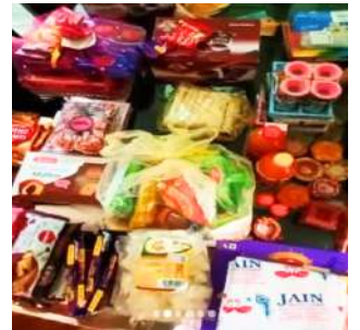
Interact Club Shines: Spreading Diwali bliss.