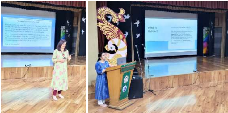
Teachers attend the Gender Sensitization Workshop at DPSGMR.

The workshop emphasized the importance of challenging societal and cultural norms that dictate specific roles for men and women, such as men being providers and women being caregivers. By promoting equality and respect, participants recognized the necessity of creating inclusive spaces that foster environments where everyone, regardless of gender identity, can participate fully and equally.