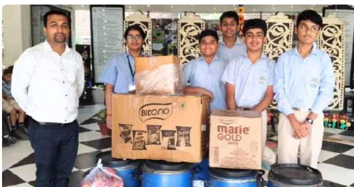
Making Diwali Special for Everyone

Ghaziabad: DPSG MR organized a donation drive for the students of Composite Vidyalaya, Morta. The initiative brought together 112 children from grades 1 to 8, who received generous gifts of sweets, candles, decorations, and biscuits. The event fostered a sense of community, kindness, and empathy, reminding everyone of the true spirit of Diwali—sharing love and light with those in need, ensuring the festival's joy reached far and wide.