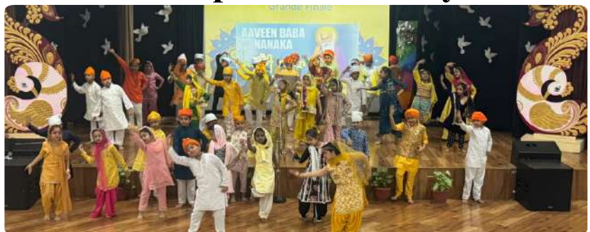
A beautiful display of faith and culture!

Ghaziabad: Students of Grades 1 and 2 celebrated Guru Nanak Jayanti with great fervour and devotion. The young learners presented a class assembly on this occasion for their peers and the parent community. They shared a glimpse of actual rituals like Prabhat Pheri, Panj Pyare, Mool Mantra. It was a commendable effort by the facilitators towards emphasizing the need of international mindedness in our young learners.