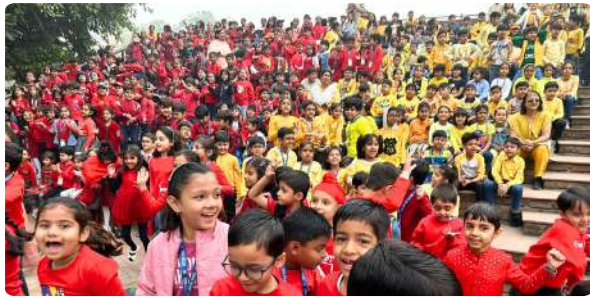
A day filled with fun, excitement and fervour!

Ghaziabad: This Children's Day, the children were treated to a melodious medley of songs, followed by a colourful dance performance. The highlight of the day was the thoughtful play by teachers of Primary Wing which mesmerized the children. The day ended on a memorable note with the children feeling special.