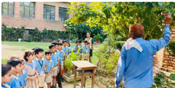
On the journey of gaining knowledge via hands-on approach!

Ghaziabad: Our Kindergarten learners had a blast as they crafted their very own 'Leaf Man' while discovering the different parts of plants. This hands-on, play-based approach made learning about plant structures so much fun and interactive! The day also featured a special talk session by our school gardener, who shared valuable insights on soil preparation and how plants grow.