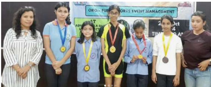
DPSG MR Sweeps Top Honours at the Flow Glow Yoga Championship!