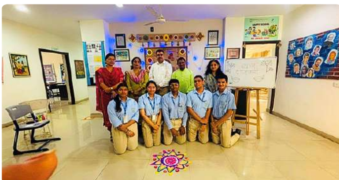
Creativity being portrayed through Rangoli and Bandhanwars

Ghaziabad: An Intersection Rangoli and Bandhanwar Making competition was organized for the learners of IBDP in the festive season of Deepawali on 29th October 2024. The students unleashed their artistic aptitude and creativity by using paints and flowers to create innovative Rangoli designs and bandhanwars. The colorful and eye-catching decorations that incorporated intricate handcrafted designs made it a visual treat for all who visited the IB wing.