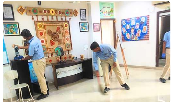
Students showcase social responsibility

Ghaziabad: Shramdaan initiative organised on October 28, 2024 was a meaningful experience for the IBDP wing learners and faculty at DPSG Meerut Road. The event provided practical lessons in teamwork and responsibility, while also fostering a sense of environmental stewardship among students and facilitators. It emphasized on the importance of community service and environmental awareness which had a lasting impact on learners' values and outlook on social responsibility.