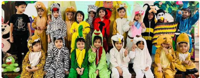
A stage full of creativity and confidence!

Ghaziabad: A Solo Stage Performance was organised with the theme – Animals for Nursery students. Solo performances play a significant role in shaping and motivating young learners to perform to the best of their capabilities and learn various skills that aid in their all-round development. This experience unlocked creativity, confidence and self expression in the young learners.