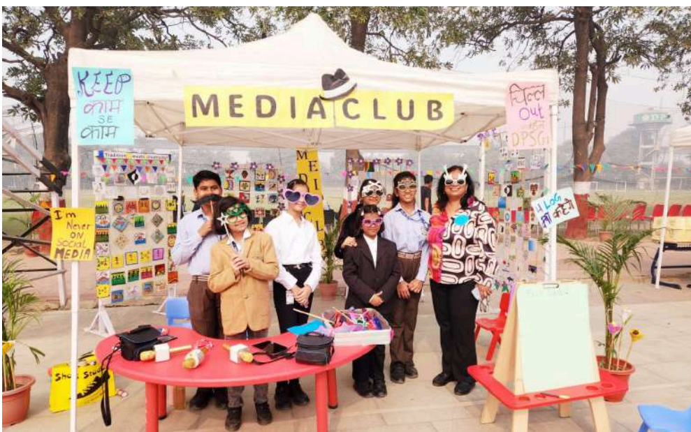
The media club served as an attraction for the kids and adults, had insightful

The live performances kept the energy levels high. Kids eagerly gathered to watch these performances, their faces lighting up with wonder and delight. Music echoed throughout the venue, encouraging spontaneous dance-offs and sing-alongs as families bonded over the shared joy of the moment. The atmosphere was further enriched by the colorful costumes worn by the children and characters roaming the grounds. The zest and zeal exhibited by the enthusiastic crowd of visitors and participants truly made the Kids Carnival 2024 an unforgettable experience. It was a day that brought people closer, sparked joy and created lasting memories.