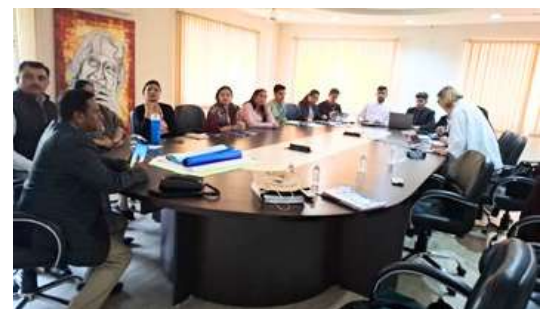
Students gaining valuable insights during the workshop

Ghaziabad: An exciting Portfolio Guidance workshop was organized for the learners of IB wing on Nov 21, 2024. Designed to equip participants with essential skills for effective portfolio management and conducted by University of the Arts London Representative Ms. Kate Scully, the session emphasized aligning individual projects with organizational objectives and optimizing resource allocation to maximize value delivery. Delegates from UAL provided valuable insights into various requirements.