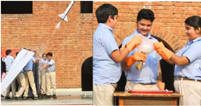
Dussehra Assembly: Victory of truth over falsehood.

Ghaziabad: In line with DPSG MR's commitment to fostering curiosity and exploration in science, the grade 7 students were given an exciting introduction to the Space Club. They attended a live demonstration featuring a range of hands-on experiments, from rocket launches to comet formation, providing them with a captivating insight into the wonders of space exploration. This session was designed to encourage scientific inquiry and hands-on learning, allowing students to experience the thrill of experimentation.