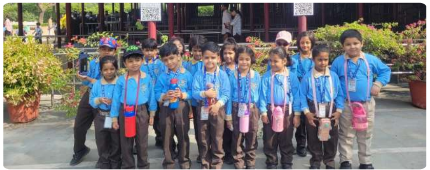
Where curiosity meets conservation!

Ghaziabad: PYP Learners visited the Delhi Zoo and marvelled at the diverse animal species and their natural habitats. This hands-on experience not only sparked their curiosity but also deepened their understanding of the essential IB concepts of connection and responsibility. Observing wildlife up close, the learners reflected on the importance of conservation and the role of us in protecting the nature.