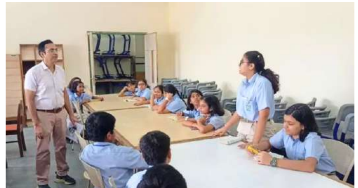
Learners exploring shapes and developing fine library session skills.

With these valuable insights, our students are now empowered and ready to approach their academic tasks with confidence and integrity. Together, we are building a strong foundation for a culture of responsible learning that will last far beyond the classroom.