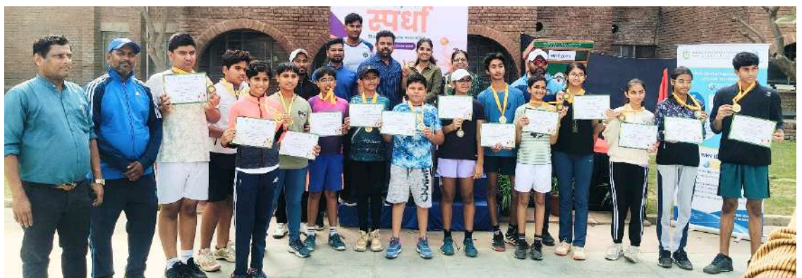
DPSG MR's Sports Fest 2024 successfully fostered a spirit of healthy competition, teamwork, and joy.