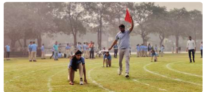
Excitement builds up as students showcase exceptional prowess!

Ghaziabad: The much-anticipated Grade 10 Annual Sports Meet 2024 took place on November 6th at DPSG MR. This prestigious event delivered a day filled with excitement, energy, and fierce competition as students from all eleven participating houses came together to demonstrate their athletic prowess, teamwork, and sportsmanship. The events included Relay, Shot Put, Long Jump, High Jump, Discus Throw, 200m Race, and many more exciting challenges!