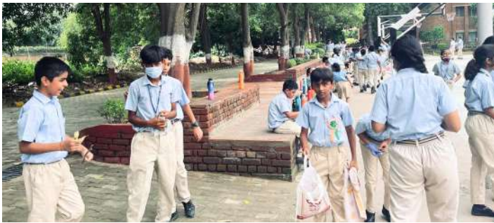
Students clean the school during the Diwali Shramdaan initiative.