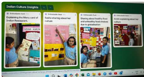
Getting to know other cultures and creating friendships!