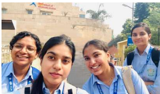
Students showcase social responsibility

Ghaziabad: A group of 46 passionate young learners from the senior wing and IBDP embarked on an eye-opening journey into the world of sustainability at TERI SAS. They explored the state-of-the-art green campus, admired the architectural marvels of sustainable building designs, and took a fascinating tour through the earth tunnel. Engaging with hands-on demonstrations on water conservation and waste management, the students gained practical insights into the environmental challenges of today.