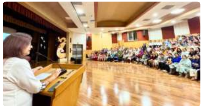
An insightful session organised by DPSG MR

Ghaziabad: A PLDP session at DPSG MR equipped Homeroom Teachers (HRTs) with strategies to enhance their roles by fostering stronger student connections and parent engagement. Focused on creating nurturing, inclusive classrooms, the training emphasized student well-being and active participation. HRTs gained insight for effective communication with parents, encouraging their involvement in their child's education, empowering teachers to build more supportive and engaging learning environments.