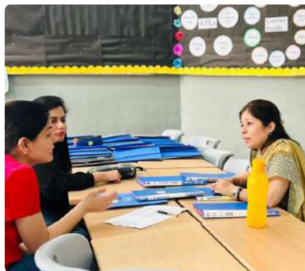
Discussing the progress of students in PTC

Heartful Appreciation note given by the Chief Guest