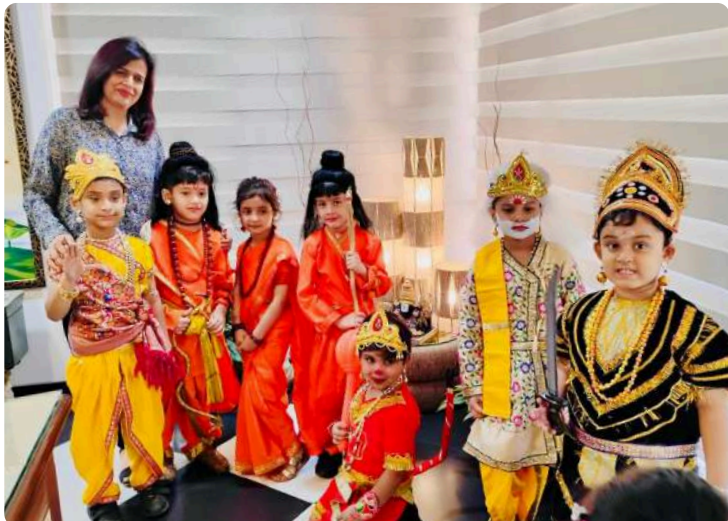
DPSG MRD's excelling performers for Dusshera

Ghaziabad: Our Kindergarten kids brought the festive spirit alive by dressing up in vibrant Indian attire today. Through celebration, they learned about the significance of Dussehra, the triumph of good over evil, and the importance of cultural values. Watching them embrace traditions while enjoying the festivities was truly heartwarming.