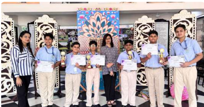
Tech brilliance on display at CODE 2K24

Ghaziabad: The talented students from the Secondary Wing made us immensely proud at the prestigious CODE 2K24 interschool competition! Our young tech enthusiasts showcased their exceptional skills, creativity, and innovation, proving their mettle in a highly competitive environment. Bringing home remarkable accolades, they have demonstrated not only their technical brilliance but also their teamwork, and passion for learning.