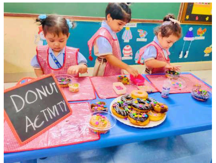
Learners exploring shapes and developing fine motor skills.

Ghaziabad: Our little learners at DPSG Meerut Road donned chef hats and joyfully decorated donuts. By using sprinkles, gems and other materials, they strengthened their hand-eye coordination while enjoying a delicious learning experience. They were also thrilled to serve their creations to friends and teachers.