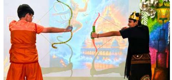
Exceptional role-plays by the learners of fifth-grade.