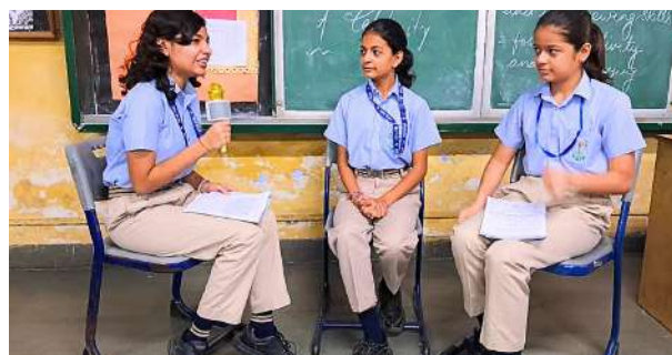
Students engaged in portraying their skills

Ghaziabad: The Radio Jockey (RJ) Club at DPSG MR has been a transformative platform for students, fostering growth in communication, creativity, and teamwork. Through activities like scriptwriting, public speaking, and broadcasting, members have honed their verbal and presentation skills. The RJ Club's initiatives have showcased their talents and contributed to a dynamic school environment, reflecting its commitment to nurturing skilled, creative communicators.