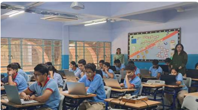
Academic brilliance on display!

Ghaziabad: The Career Counselling and University Placement (CCUP) cell of DPSG MR, in collaboration with the College Board, conducted the PSAT exams for grades 8-10, offering early exposure to international testing. 84 students participated, actively engaging in Evidence-Based Reading, Writing, and Mathematics to assess readiness. Results will guide personalized learning, fostering critical thinking and marking a valuable step toward future academic success.