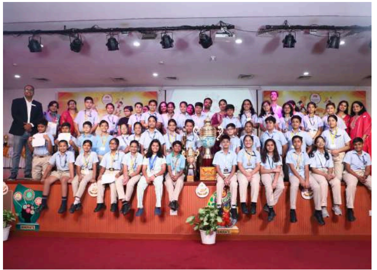
Exceptional performance by DPSG MR students.