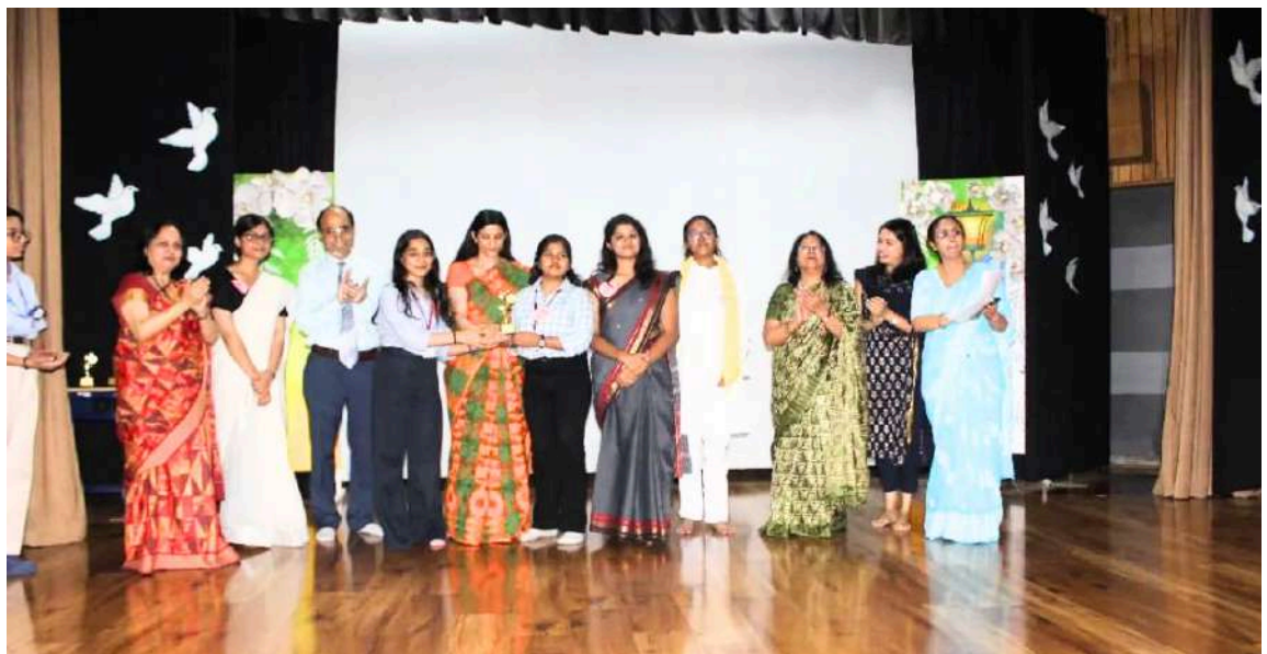
Recognizing the power of education through our inspiring teachers!