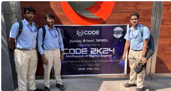
IBDP Learners showcasing their commendable skill

Ghaziabad: DP learners participated in an IT Symposium held on October 7, 2024. The event organised by CODE (Confluence of Digital Experts) Club, Apeejay School, NOIDA provided a platform for the DP learners to showcase their talent in the field of technology and achieve technological brilliance.