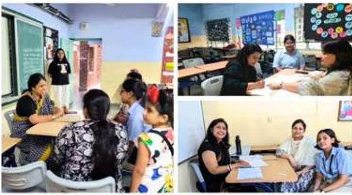
Parents engaged in meaningful discussions with teachers.

Parents engaged in meaningful discussions with teachers, receiving comprehensive feedback on their children's performance in the Mid-Term Examination. Many expressed satisfaction with the personalized attention their children receive. In addition to the conference, parents also explored the Foundation Domain Exhibition and enjoyed the captivating performances in Theatre, Dance, and Choir.