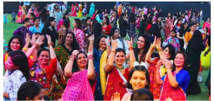
DPSG MR celebrates Garba with enthusiasm and zeal