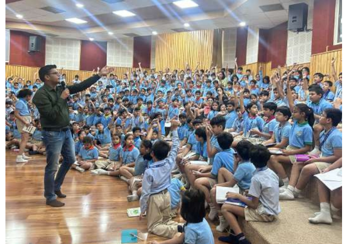
DPSG PYP learners on way to enhance their analytical skills

Ghaziabad: LogIQuids recently conducted an engaging workshop for students and teachers, focusing on effective strategies for solving logical reasoning questions. The event garnered tremendous enthusiasm, particularly among students who eagerly participated in the interactive sessions.