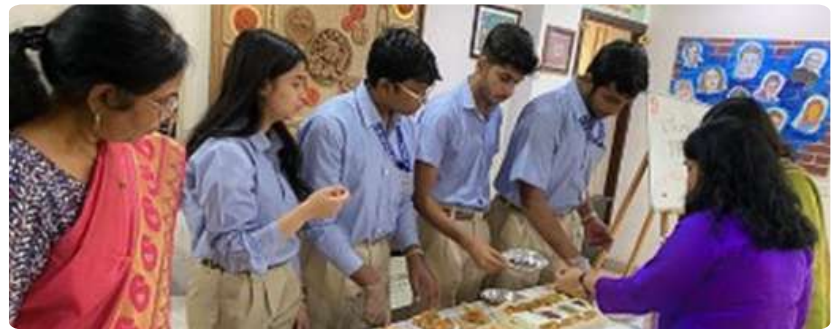
Students displayed their culinary talent at the Yummy Tummy Competition

Ghaziabad: On the occasion of World Food Day, the learners of IB wing participated in Yummy Tummy competition. The event showcased a kaleidoscope of flavours and culinary delights comprising of bakery items, chaat and desserts. Together, the learners put up a splendid show and came up with a unique way of presenting the delicacies thereby turning a mere competition into a triumphant event.