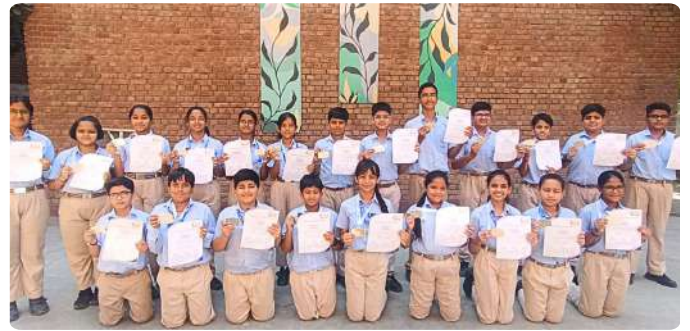
Shining bright with success—hard work pays off!