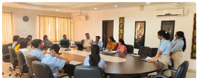
Moments from our Mental Health Talk Show—students sharing insights on wellness

Ghaziabad: IBDP Psychology learners came up with an innovative idea of hosting a Talk show and conducting a Quiz on Mental Health on the occasion of World Mental Health Day on 10th October. Participants engaged in meaningful discussions around the nuances of mental health and was instrumental in breaking the stigma by improving attitudes towards the issue and reducing the shame associated with speaking openly about mental well-being.