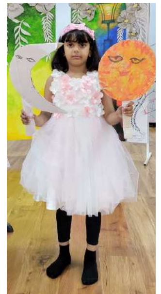
Young Storytellers mesmerised the audience