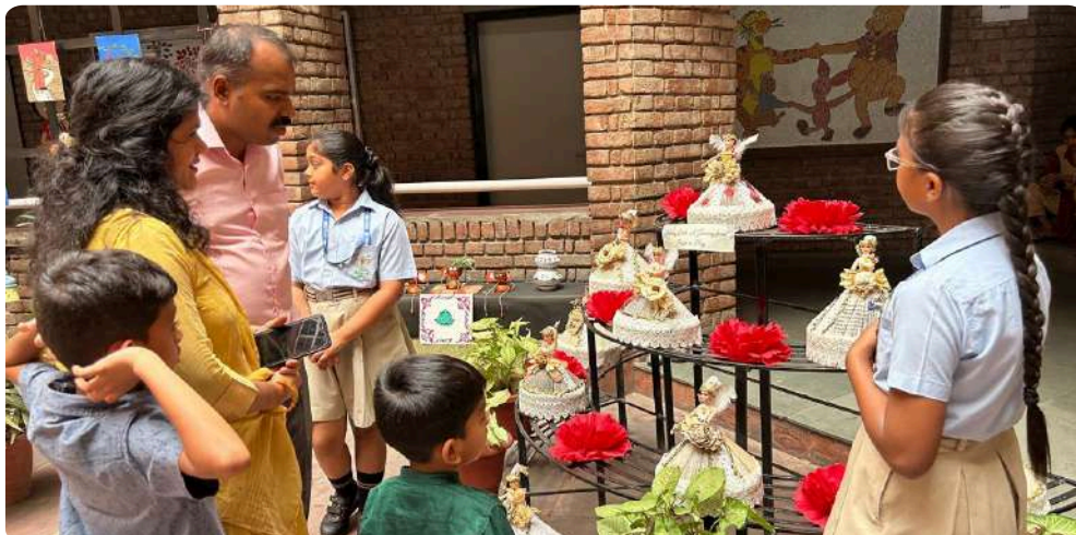
Celebrating creativity at our school art exhibition, showcasing the incredible talent of our students