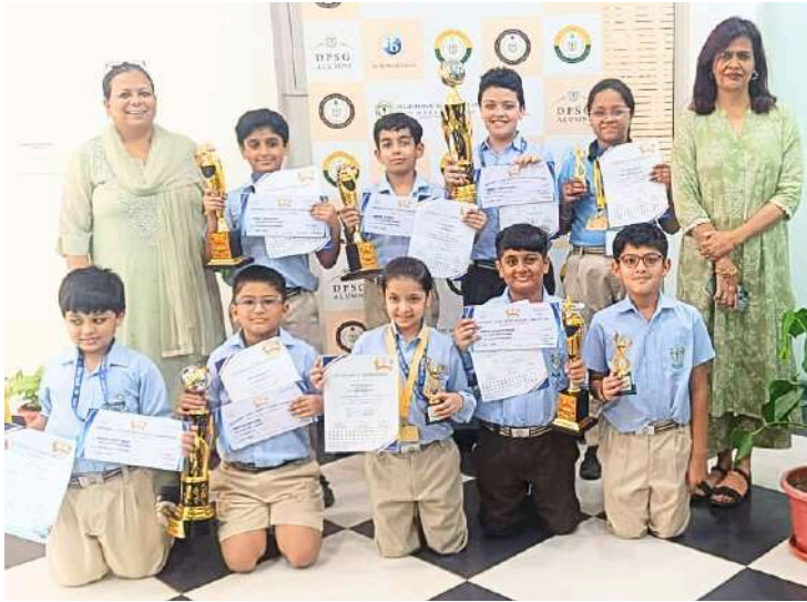
DPSG PYP learners shine at BOB competition

Ghaziabad: DPSG MR students delivered outstanding performances. DPSG Meerut Road has carved a distinctive niche in the region with its commendable result in the BOB WONDERKID 2024. The school has been awarded City Rank: 1 & National Rank: 2 in this prestigious competition. This notable recognition highlights our unwavering commitment to delivering exceptional education and nurturing future leaders. 6 students have been recognized as National Wonderkids, securing ranks between 1-25, while another 6 have emerged as National Toppers, achieving ranks between 26-50. Furthermore, 223 students have earned gold medals and 219 have secured silver medals, showcasing the exceptional talent and dedication of our student body.