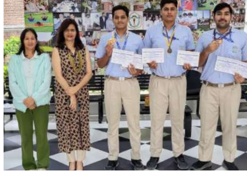
Agile athletes-a testimony to their hard work and dedication!