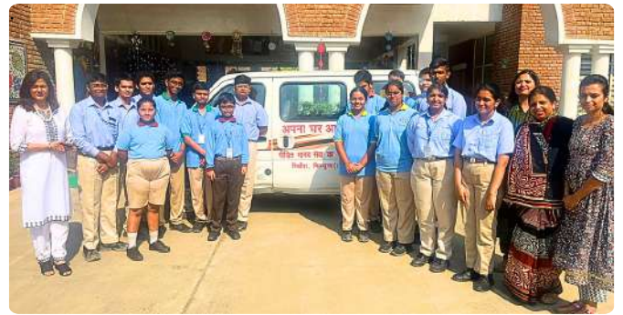
Celebrating Diwali through acts of kindness!

Ghaziabad: DPSG MR organized a donation drive for 'Apna Ghar,' a home for the destitute in Pilakhua that cares for 90 residents. This heartfelt initiative was met with overwhelming support from the school community, as students and staff contributed generously to make the festival memorable for the inmates. The donations included essential dry ration items, tea-time snacks, diyas and candles. This act of kindness and generosity reflects the school's commitment to instilling values of compassion and empathy in its students, teaching them the true meaning of Diwali i.e. spreading