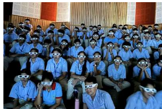
Students enjoying the extracurricular activities

Ghaziabad: DPSG MR recently hosted an exhilarating 3D Edutainment Show for the students of Grades 6 and 7. This immersive event introduced the young learners to fascinating subjects through three captivating shows: Chandrayaan 3, Chotu Dinosaur, and The Shark. The 3D format brought these topics to life, offering students a thrilling, hands-on experience that deepened their understanding of science and nature.