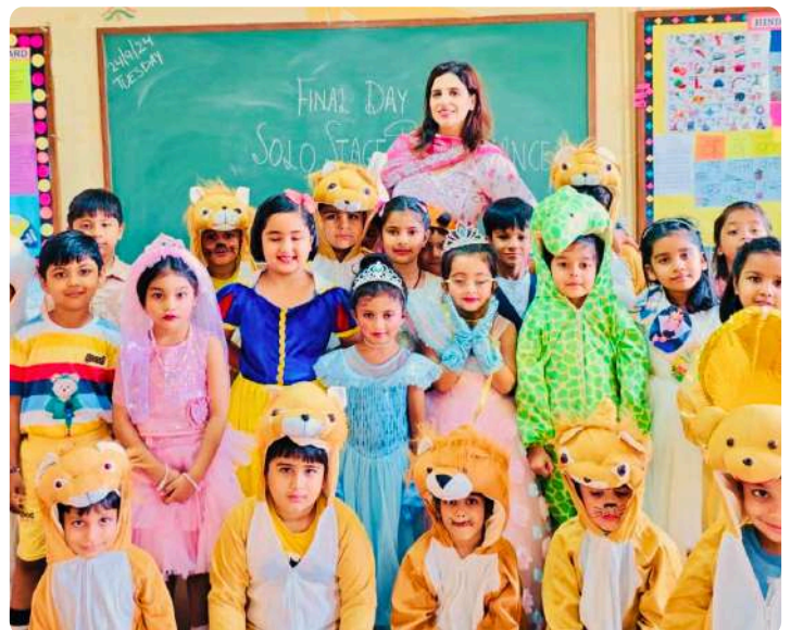
Young Storytellers mesmerised the audience

Ghaziabad: Aligned with the Unit of Inquiry, How We Express Ourselves Through Stories, this experience unlocked creativity, confidence, and self-expression in the young learners. Budding storytellers enchanted the audience with their words, actions, and emotions, leaving everyone in awe.