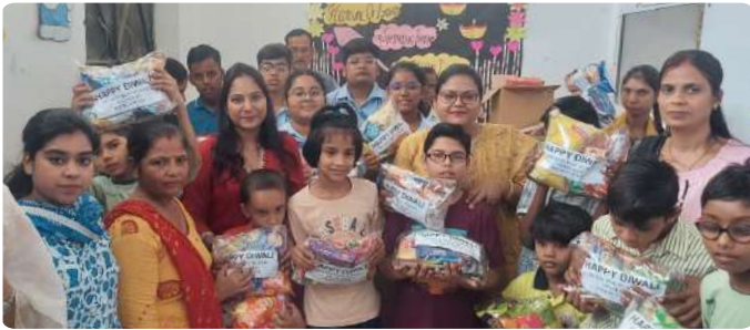
Spreading Festive Joy To Everyone!

Ghaziabad: DPSG MR organized a donation drive on 24th October 2024, aimed at spreading festive joy to children and adults with intellectual and developmental disabilities. The event was held in collaboration with the Shri Adwait Pariwar Foundation, which works with around 50 individuals affected by developmental disabilities. The initiative aimed to bring light and happiness to the lives of the foundation's residents by providing festive essentials. Beyond material support, the drive fostered emotional connections and a sense of inclusion for the participants, especially children. The joy and excitement visible on their faces reflected the success of the event.