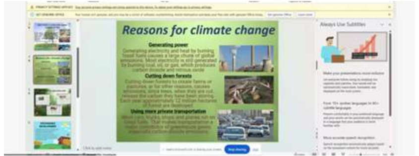
Where curiosity meets inspiration!

Ghaziabad: CASTHENICS, the annual online mega event of IBDP wing was a blast! The events put the spotlight on the talents and skills of 21st-century learners making it an exciting experience for all participants. The event catered to all with diverse tastes in scientific, film making and linguistic skills. With participation from numerous schools, the event left behind countless unforgettable memories, cementing itself as a truly remarkable celebration of talent.