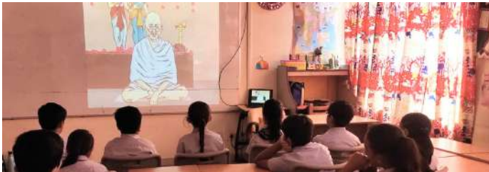
Values being instilled in learners