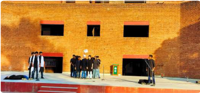
Dussehra Assembly: Victory of truth over falsehood.

Ghaziabad: The Secondary Wing of Delhi Public School Ghaziabad marked the auspicious occasion of Dussehra with a special assembly, celebrating the triumph of good over evil. The students thoughtfully highlighted the significance of the festival. Nitya Sharma captivated the audience with a self-composed poem, adding a personal touch to the celebration. A powerful theatrical presentation, depicting the victory over societal vices, was also performed by the students, leaving a lasting impact on the audience. The Headmistress addressed the gathering, encouraging students to introspect and conquer their own weaknesses, aligning with the true spirit of Dussehra.