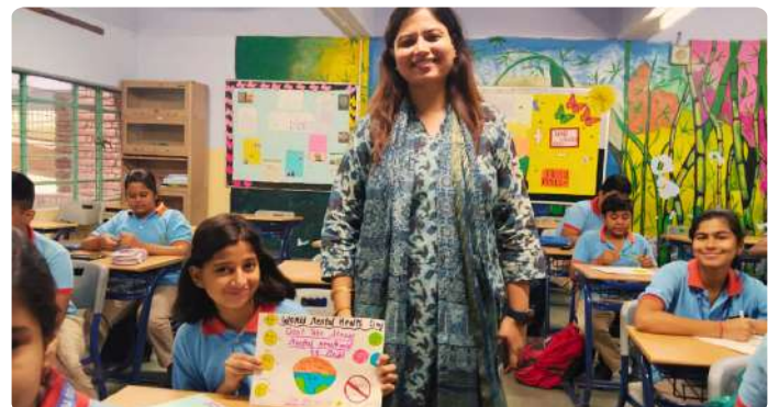
Students expressing their emotions through art!

Ghaziabad: On October 10, 2024, DPSG MR organised the ‘Paint Your Emotions’ activity to mark the World Mental Health Day. Students creatively expressed their emotions using A4 sheets and various colouring materials, fostering emotional awareness and promoting mental health. The event successfully encouraged open conversations about mental well-being. It provided a platform for self-expression and helped reduce the stigma around mental health.