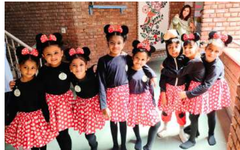
CREATAL-23: Literary Festival Unleashes Creativity!

The literary festival 'CREATAL-23' was a resounding success, celebrating the magic of literature in diverse forms.