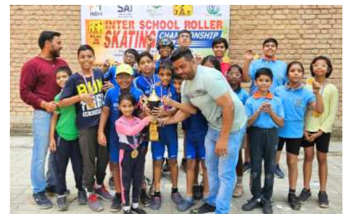
The skating champions of our school did wonders!

Ghaziabad: 220 students participated in the Inter-School Roller Skating Championship hosted at DPSG Meerut Road.