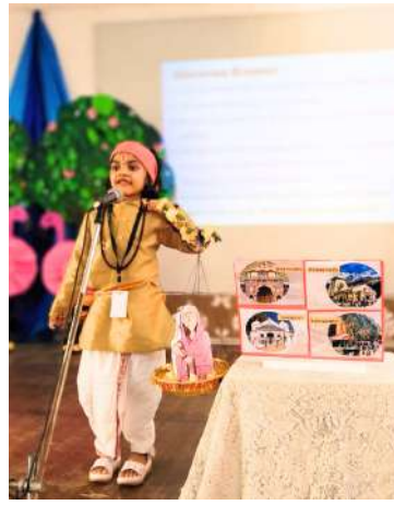
EXUBERANT EXPRESSION: Young performers showcasing their talent, took us to the world of fantasy with their lovely tales.