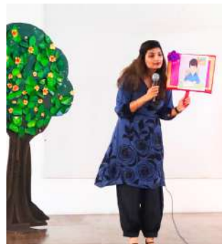
EXPERT VISIT: Exciting Day of Exploration for the young learners.