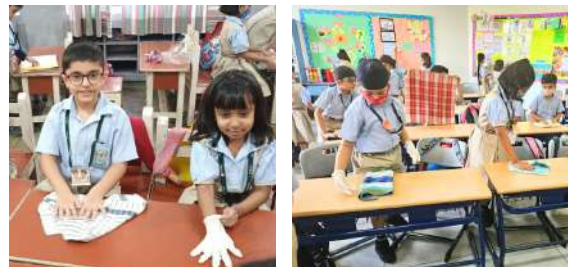
The youth of tomorrow promoting cleanliness through 'Shramdaan'