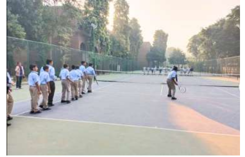
Students get a tremendous opportunity to play alongside the tennis legends of India