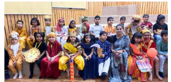
Grade 1 Tell A Tale encouraging students to tell stories in their own way.