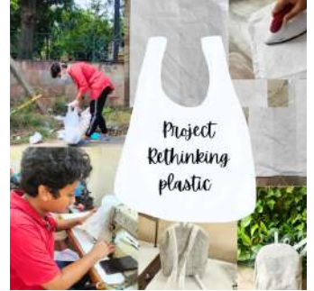
Redefining sustainability with biodegradable bags and the 4 R's

I was on my way to the nearby market when I saw a monkey eating something from a plastic bag and end up eating the plastic bag itself. I was concerned and decided to do something about it. I started collecting the disposed plastic bags and used approximately 12 of them along with 2 plastic sacks to make this unique biodegradable bag which can be put to multiple uses.