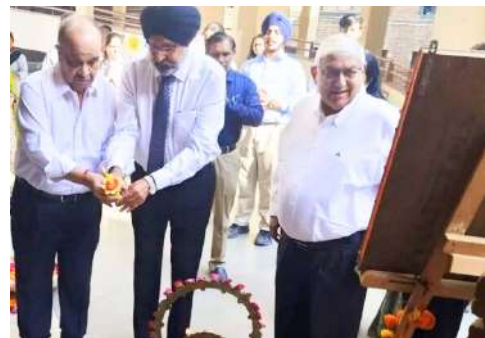
Vanijya Mahotsav: Shaping the business leaders of tomorrow.