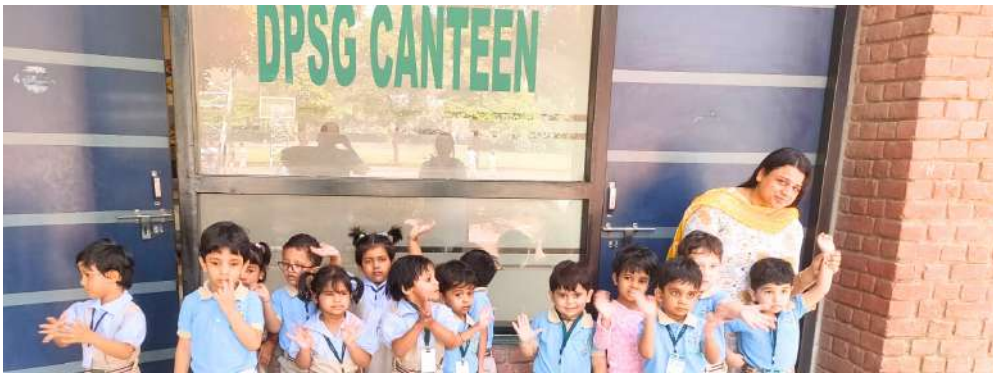
CANTEEN VISIT: Primary Wing students of DPSG Meerut Road, visit the canteen.