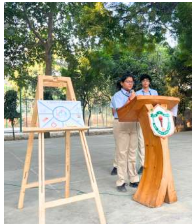
Remembering Mahatma Gandhi and Lal Bahadur Shastri: Quiz and speech