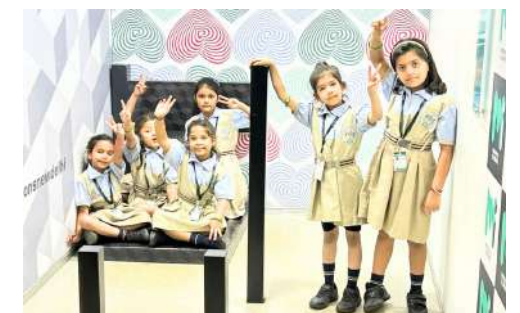
Educational trips inculcating the spirit of learning by doing in the young learners.