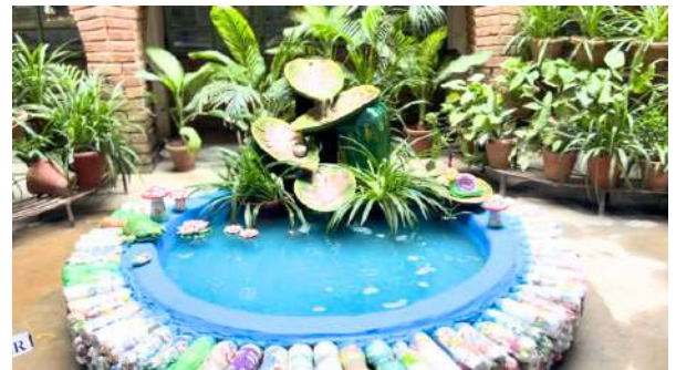
Waste to Wonder: A Sustainable Vision