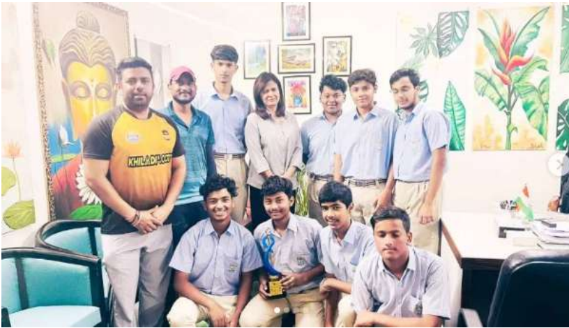
Celebrating our football stars

Ghaziabad: In a thrilling tournament featuring 16 formidable teams, they emerged as champions, securing the 1st position. What an incredible accomplishment! Individual brilliance shone as well, with honors going to our exceptional players: