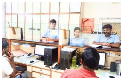
DP1 students' valuable learning experience at school's Finance and Accounts department

Ghaziabad: The Business Management students of DP1 visited the Finance and Accounts department of DPSG Meerut Road in order to gain insight into the financial operations of the school and understand the intricacies of managing finances in an educational institution. It provided them a unique opportunity to bridge the gap between classroom learning and practical application.