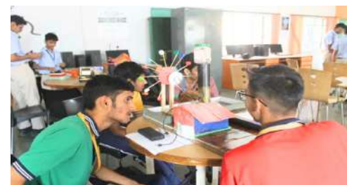
INFINITUS 2023: Where brilliance meets innovation