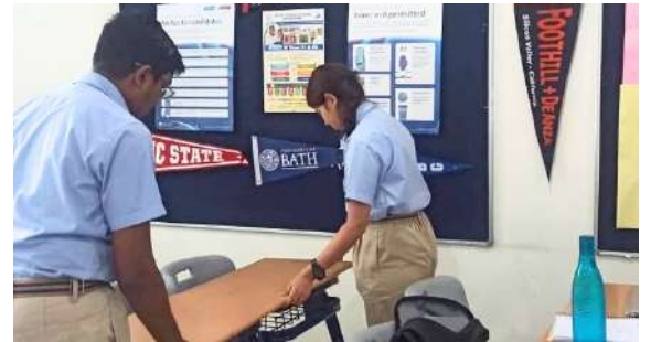
IBDP students performing shramadaan in the IB wing