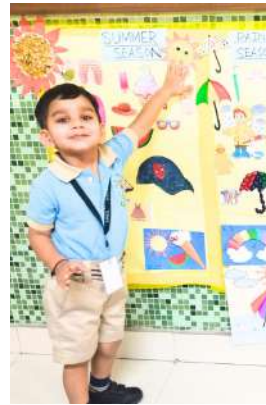
SEASONS: Pre-Nursery students of DPSG Meerut Road learn about seasons through interactive charts.