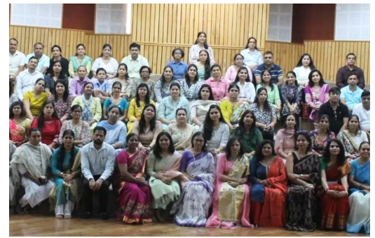
Hindi Diwas Celebration: Hindi is our pride, Hindi is our identity.