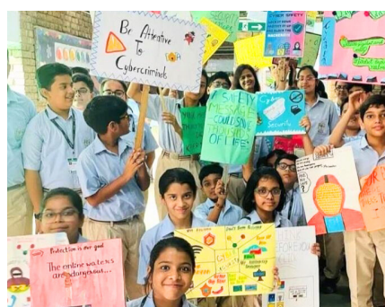
The youth of tomorrow promoting Cyber Safety and Security