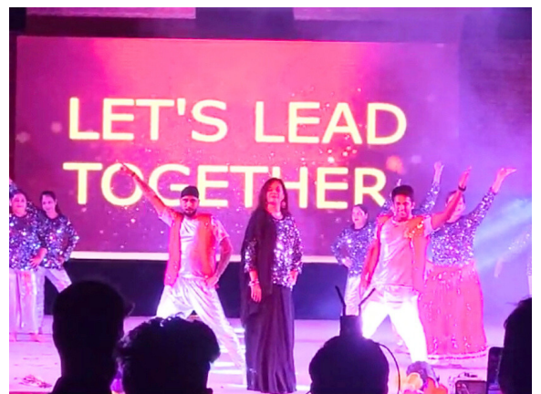
Grand Celebration on the occasion of Teachers' Day