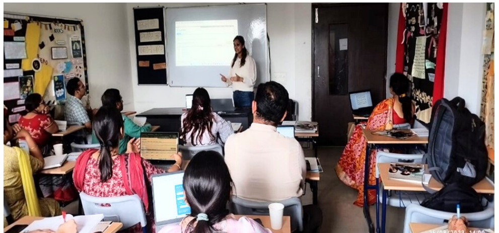
Teachers workshops, shaping the future educational goals

The workshop also provided valuable insights and guidance for best usage of practices in order to achieve educational goals.