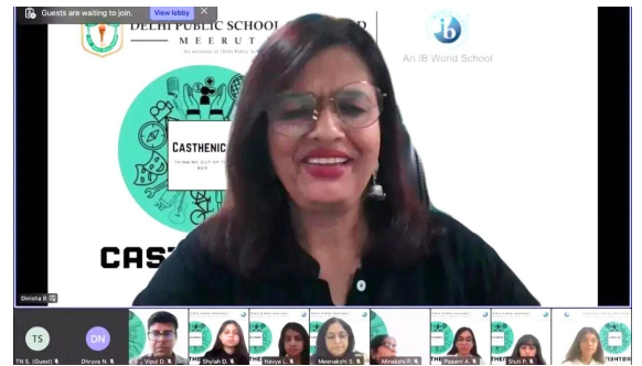
IB's Casthenics 2.0, inculcating creativity, activity and service in the future generations