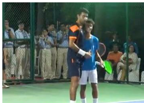
Students get a once in a lifetime opportunity to play alongside the tennis legends of India