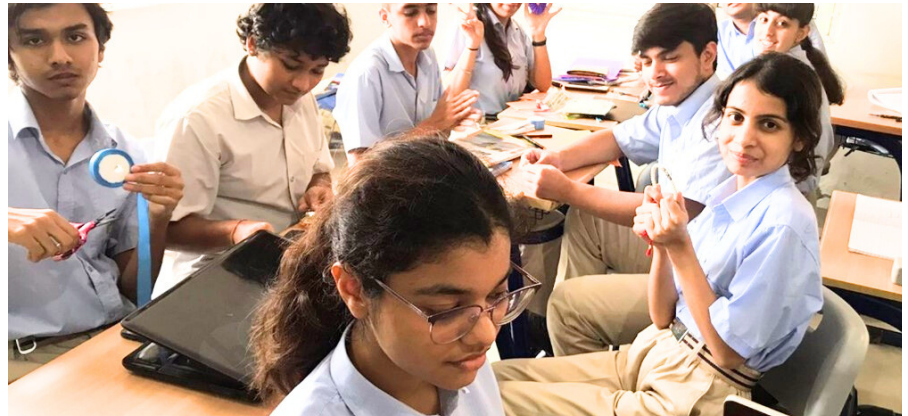
IB's Rakhi Making Activity, encouraging students to put on their creative hats

Ghaziabad: Rakhi Making Competition was organized in the IB wing with the aim of fostering creativity and craftsmanship among the pupils. The event provided a platform for participants to showcase their artistic skills and create unique rakhis that combined traditional sentiment with modern creativity and allowed the learners to express their love and creativity through handcrafted rakhis. The event fostered a sense of unity and joy during the festive season and was a memorable experience for all.