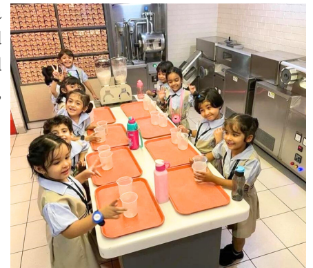
Educational trips inculcating the spirit of learning by doing in the young learners.