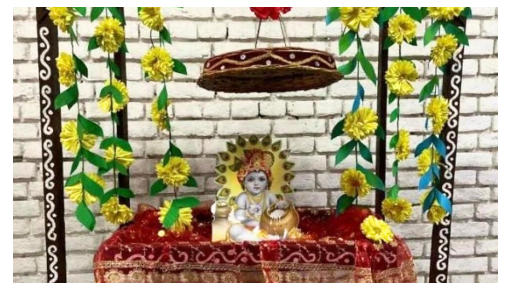
Grade Prep's enthusiastic Janmashtmi celebration: Little Hearts, Big devotion!