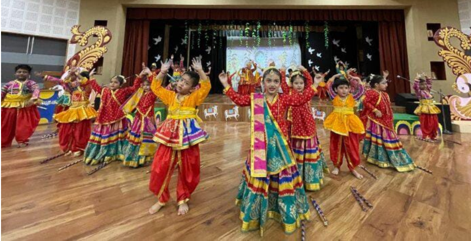
JANMASHTAMI: Young performers showcasing their talent, Dandiya at Janmashtmi Celebrations