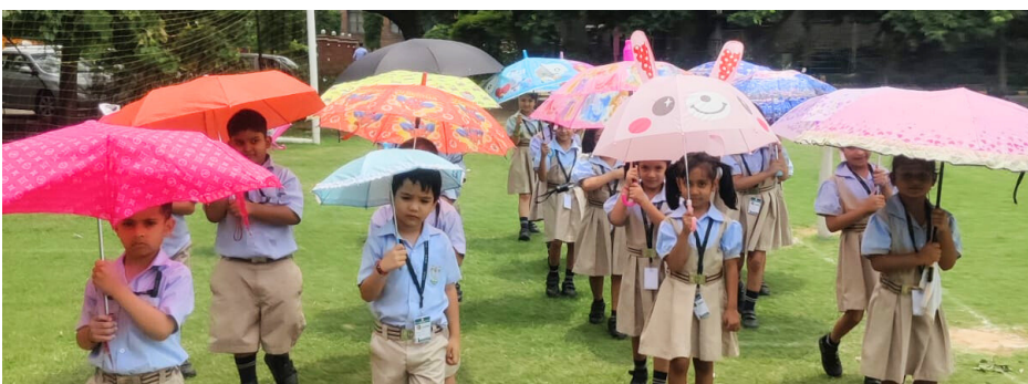
UMBRELLA DAY: Exciting Day of Exploration for the young learners.