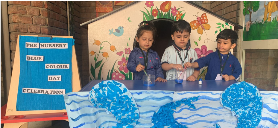
IN LOVE WITH BLUE: Pre-Nursery students of DPSG Meerut Road have fun, celebrating Blue Colour Day