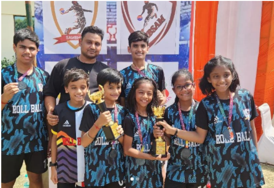
DPSG's Roll Ball achievers with their coach

At DPSG, we are overjoyed to share our triumph at 14th MINI AND 16TH JUNIOR U.P STATE ROLL BALL CHAMPIONSHIP. This recognition reaffirms our dedication to shaping students who are well-prepared to excel in every sphere of life.