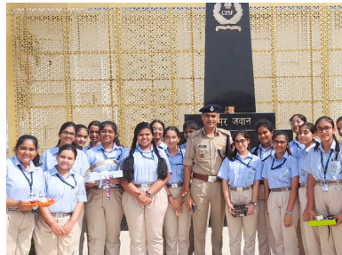
Interact Club students celebrating Rakhi at CISF Campus, Indirapuram