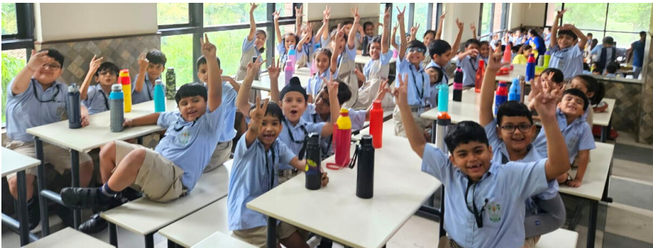
CANTEEN VISIT: Primary Wing students of DPSG Meerut Road, visit the canteen.