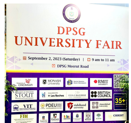
Fruitful Interactions: Ghaziabad's biggest University Fair brings together parents, students and representatives from Universities.