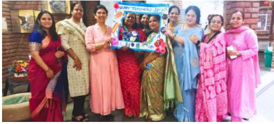
Making a glorious event to cherish forever.

Ghaziabad: Teachers' day was celebrated with great favour at DPSG MRD! A warm welcome and a special assembly by Junior Wing Student Council along with Grade 4 students was a pleasant surprise for all the teachers honouring their dedication.