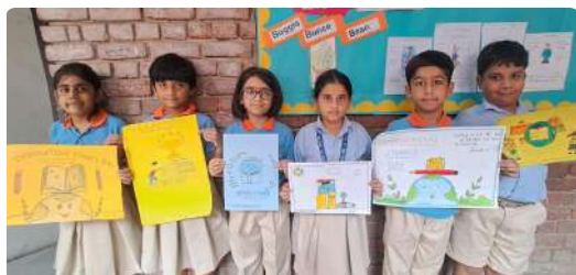
Celebrating the power of education at DPSG MRD!

Ghaziabad: The World Literacy Day is celebrated every year on September 8. At DPSG Meerut Road students were encouraged to participate in a variety of engagements to raise awareness about the importance of education and to inspire action to improve literacy rates.