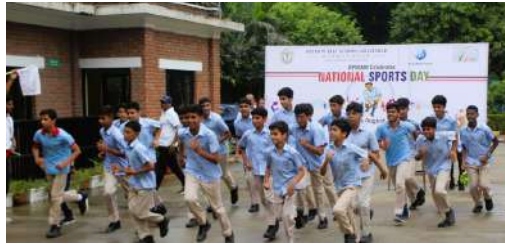
National Sports Day Run at DPSG