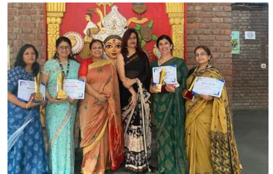
These accolades reflect our commitment to excellence and our dedication to providing exceptional education.