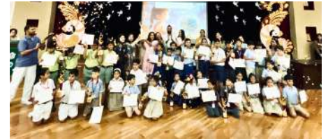
Where curiosity meets inspiration!