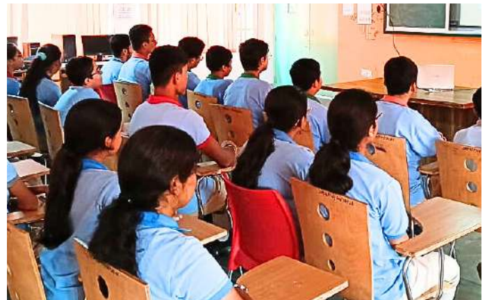
DPSG MRD learners pledge against drug abuse