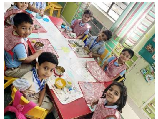
Students learning to collaborate with each other.

Ghaziabad: Fireless cooking is just a start for the kids to learn cooking. It not only teaches cooking to the children but also teaches some valuable skills of life. This encourages children's creativity, thinking and problem solving skills like measuring, counting and following the instructions. Enthusiastic learners of Class KG showed their keen interest in the field of cooking by using their talent in preparing tasty Aloo Chaat. They learnt much from this activity and doors of their mind opened to creativity and decoration aspect.