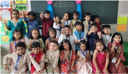
बच्चों का जोश और शानदार प्रस्तुतियाँ!

Ghaziabad: डीपीएसजी मेरठ रोड में कक्षा 1 से 5 तक के विद्यार्थियों के लिए हर साल हिंदी सप्ताह बड़े उत्साह से मनाया जाता है। 12 सितंबर को प्राथमिक विद्यालय की प्रार्थना सभा में कक्षाओं ने हिंदी रैली, नाटक, और कवियों की वेशभूषा में शानदार प्रदर्शन किया। बच्चों के जोश और प्रतिभा को सभी ने खूब सराहा, जिससे यह कार्यक्रम और भी खास बन गया।