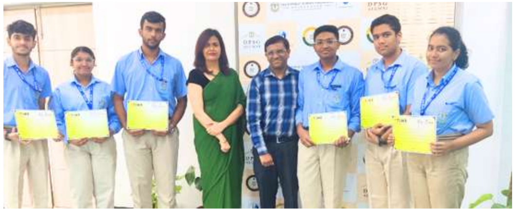
IBDP Learners showcasing their commendable skills and dedication

The learners excelled in the BIZECOM 2024 online Inter-School General Knowledge Quiz, organized by T.I.M.E Education. Among 400+ participants, they emerged victorious, showcasing exceptional knowledge and global awareness. This achievement demonstrates their critical thinking, analysis, and application skills. The quiz provided a valuable platform for learners to showcase expertise and competitiveness. The school's triumph reinforces its commitment to academic excellence, critical thinking, and global awareness. This challenging quiz lent the learners a valuable opportunity to showcase their understanding of global affairs.