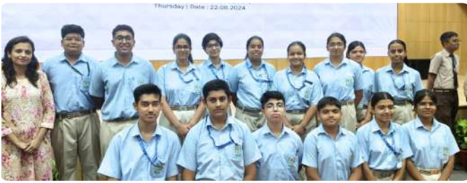
Fostering a positive digital environment