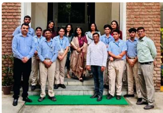
Students expressing heartfelt thanks to their mentors

Ghaziabad: IBDP learners made their educators feel special and valued this Teachers' Day by showering their love, adoration and respect upon them. They put together a quick dramatic performance peppered with mimicry and songs. Their spontaneous, bubbly performances mesmerized the teachers and had them responding with resounding claps of joy and experiencing a gamut of emotions.