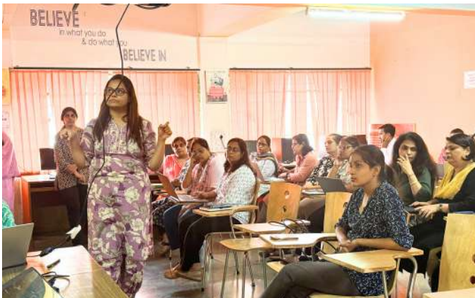
Empowering educators through technology

Ghaziabad: The ICT Department of the Secondary Wing conducted an insightful PLDP session on the Learning Management System (LMS). Educators explored the diverse functionalities of LMS, gaining practical experience in managing assignments, assessments, and tracking student progress. The session emphasized the importance of mastering LMS tools to enhance content delivery and streamline educational management. The teacher participants created assessment tools and delved into strategies for efficiently utilizing LMS in their teaching practices.