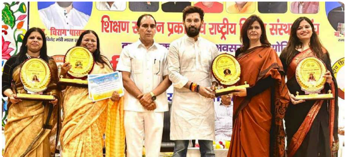
Recognizing the power of education through our inspiring teachers!