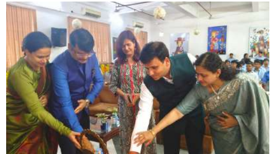
Installation of our Interact Club, where passion meets purpose!