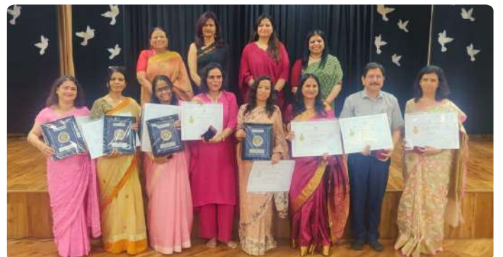
Acknowledging teachers for their years of dedication and impact.