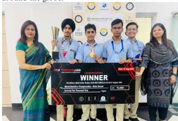
DPSG MRD applauds hard work and dedication

Ghaziabad: Students of DPSG MRD brought laurels to the school by triumphing in the prestigious TechnoXian World Cup 2024 Robo Soccer Challenge, the world's largest robotics championship. With over 10,000 participants from 50+ countries, this international competition, held in association with IFES, showcased outstanding innovation and technical skills from young minds around the globe.