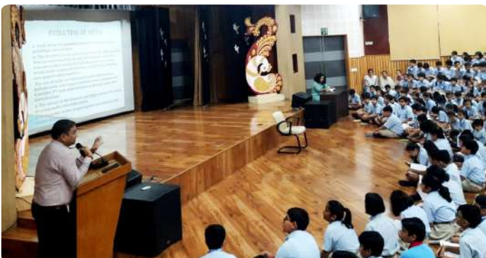
Grade 5 Students Gain Media Insights and Fact-Checking Skills.

With practical tips on fact-checking and source verification, our students are now better equipped to navigate the digital world with confidence.