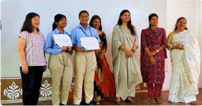
Where words become weapons and fluency wins the day!

Ghaziabad: DPSG MRD proudly hosted Sangam, an inter-school competition that celebrated the beauty of foreign languages and Sanskrit. The event saw enthusiastic participation from top schools across the NCR, showcasing a wide range of talents. The programme was a resounding success, with students deeply immersing themselves in the vibrant world of languages. It provided a platform for students to foster an appreciation for global cultures and traditions while encouraging collaboration and friendship among participants.