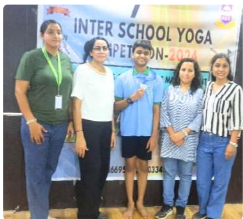
DPSG MRD's yoga team shines at inter school tournament!