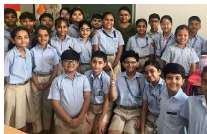
Learners exploring nutritious cuisines