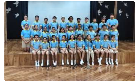
Grade 4 and 5 students mesmerize with their melodious voices!