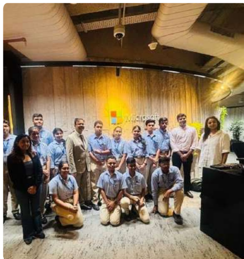
Microsoft adventure: students discover the tech world and career opportunities!