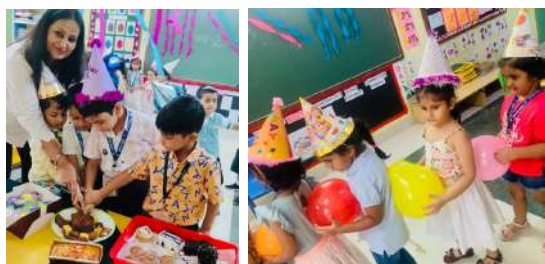
Nursery learners at DPSG Meerut Road celebrate birthdays with creativity

Ghaziabad: Birthdays are a joyous occasion at DPSG Meerut Road. Celebrating these special days in a preschool setting not only adds excitement but also offers various developmental benefits for young learners. The young learners of Nursery class celebrated birthday by decorating their classrooms and enjoying with friends and teachers. During the theme 'How We Express Ourselves,' the learners transformed their classroom into a vibrant display of creativity. Through this inquiry-based celebration, they discovered various forms of self-expression, learned about the importance of communication and identity, and enhanced their creativity and confidence.