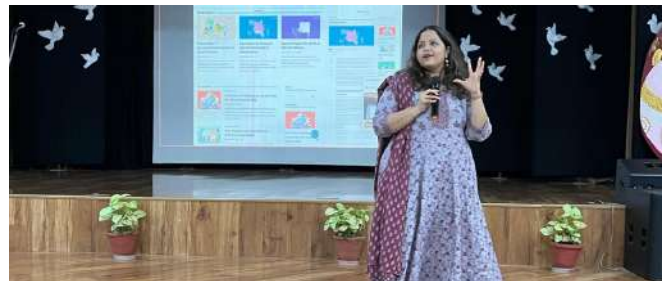
Where curiosity meets inspiration: a dynamic session sparking young minds