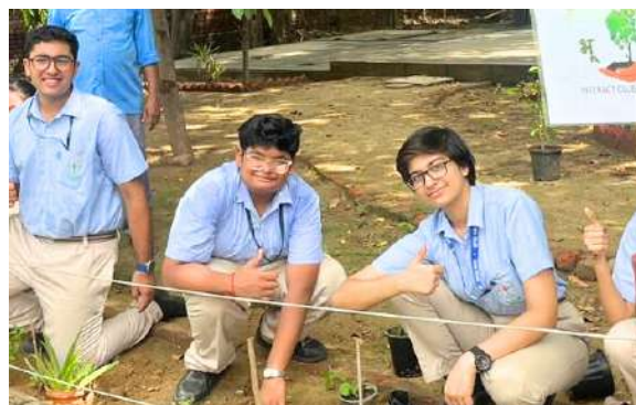
The students leading charge of plantation

Ghaziabad: The Interact Club of DPSGMRD proudly launched the Rotary year 2024-25 with an inspiring and impactful project titled "भू-प्रहरी" (Earth Guardians). This initiative underscores our unwavering commitment to protect the environment and foster a greener future for generations to come. Our enthusiastic Interactors have taken on the vital role of environmental stewards, dedicating themselves to making a positive impact on their community. Through "भू-प्रहरी", they aim to raise awareness about environmental issues, promote sustainable practices, and implement eco-friendly initiatives. As the Interactors embark on this noble endeavor, they set a shining example of youth-led environmental activism.