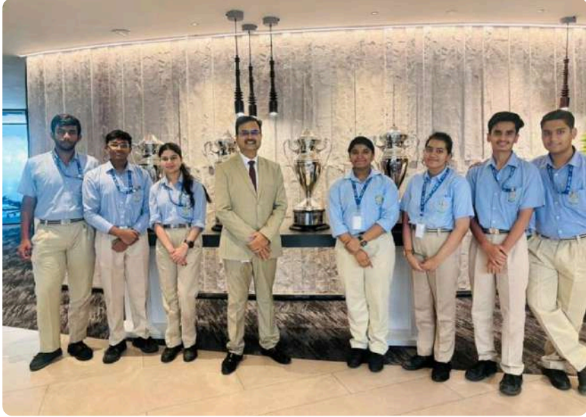
IBDP learners experiencing work culture and technological advancements at MICROSOFT Office.

Ghaziabad: On August 13, 2024, IBDP learners had an exceptional opportunity to experience the cutting-edge world of technology and innovation during their visit to Microsoft Office in Gurugram. This initiative, known as 'A Day at Microsoft,' was designed to connect academic learning with real-world industry applications, providing students with a firsthand look into the dynamic work culture and technological advancements at one of the world's leading tech giants. The experience included interactive sessions that showcased Microsoft's latest innovations and provided a glimpse into the daily life of professionals in the tech industry. This hands-on exposure was intended to broaden the students' understanding of the tech sector and equipped them with valuable knowledge and inspiration for their future professional journeys, fostering a newfound enthusiasm for technological innovation.