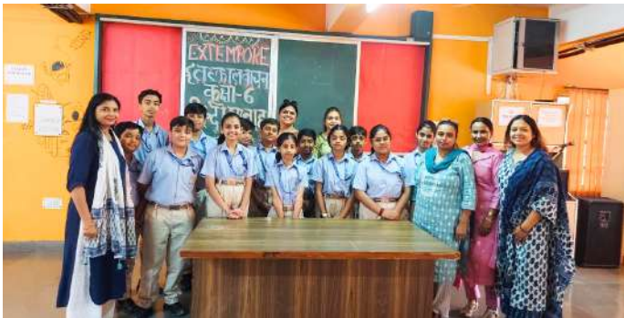
Where words become weapons and wit wins the day!

The competition highlighted the exceptional talent and dedication of the participants, leaving a lasting impression on all present.