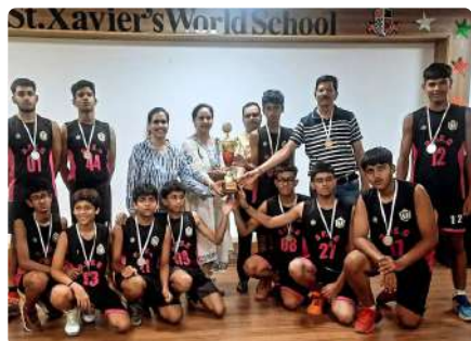
DPSG MRD's basketball team shines at district tournament!

Ghaziabad: The U-17 basketball team from DPSG Meerut Road brought laurels to the school by securing the first runner-up position in the District Basketball Tournament. The team displayed remarkable skill, determination, and sportsmanship throughout the tournament. Kudos to the players and coaches for their exceptional effort and dedication, which led to this outstanding achievement! Hats off to our talented basketball players!