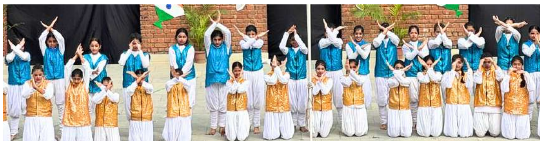
Honoring our nation's heroes, shaping tomorrow's leaders with mixture of patriotism and joy