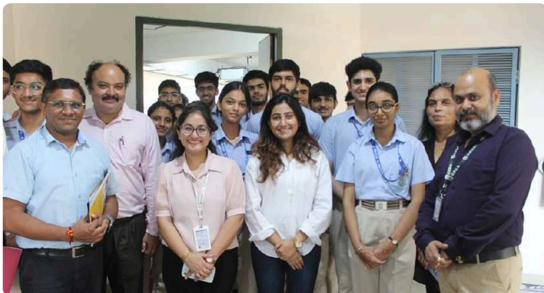
Students exploring opportunities at the University Fair, gaining insights and guidance for their future academic journeys