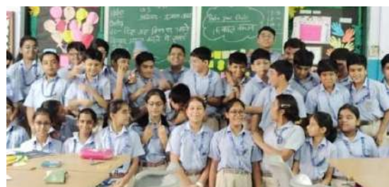
The students' impressive reading performance during Hindi Week

Ghaziabad: In the Secondary Wing of DPSG Meerut Road, Hindi Week was organized to foster a love for the Hindi language and preserve cultural heritage. The purpose of this event was to encourage students' reading and thinking abilities. Language is not just a combination of words but a medium for the exchange of emotions and thoughts. With this objective in mind, the program began with a prompt reading activity for grade 6. The students shared their thoughts on topics such as the decline of moral values, the impact of online education, and the influence of social media. The students participated enthusiastically and demonstrated impressive reading skills.