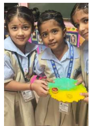
Celebrating the Bond of Love and Unity