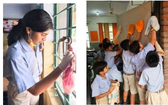
Students and staff unite in the Shramdaan drive, transforming the school into a cleaner place.