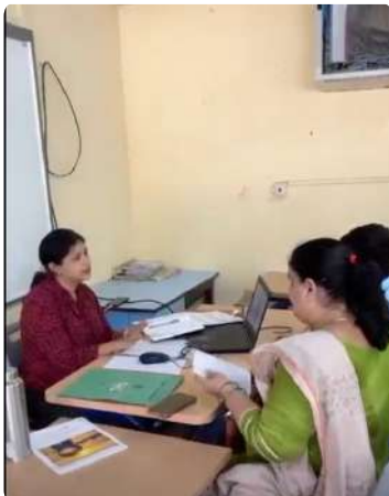
Strengthening bonds and boosting student success at our PTC!

Ghaziabad: The Secondary Wing of DPSG MRD hosted a successful Parent-Teacher Conference on August 3, 2024. This event brought together parents and teachers to discuss students' growth and development. It provided a valuable opportunity to celebrate achievements, address concerns, and collaborate on personalized strategies for each child's success in the upcoming examinations. The partnership between dedicated educators and supportive parents continues to pave the way for a bright future for the students!