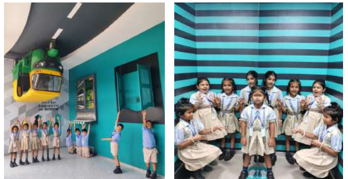
Students explore how illusions trick the mind!

One of the favourite parts was the "Vortex Tunnel," where walking through it felt like the ground was spinning beneath us. It was a little dizzying, but so much fun! The museum also had puzzles and brain teasers that made learners think hard, and they loved trying to solve them together.