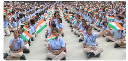
Independence Day's Joy: Embracing patriotism