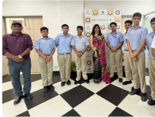
DPSG MRD Sweeps Top Honours at the Indo-Malaysia Online Chess Tournament 2024 .

Ghaziabad: The school achieved remarkable success at the Indo-Malaysia Online Chess Tournament 2024. The tournament saw participation from 55 students representing various schools and academies across India and Malaysia, competing in three age categories: U-12, U-15, and U-18. DPSG MRD emerged victorious, clinching first place in all three categories and securing the overall championship. Our students not only excelled in their respective categories but also demonstrated outstanding sportsmanship throughout the competition, earning accolades for their perseverance.