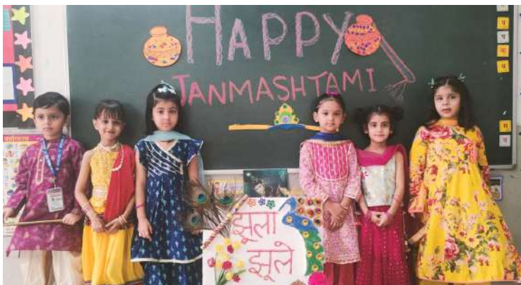
Little ones celebrating lord Krishna's Birthday with love and enthusiasm!

The event was a great success, leaving the children with smiles on their faces and memories to cherish.