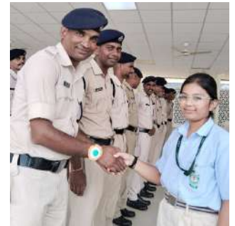
DPSG celebrates Raksha Bandhan with Indian Soldiers who protect us every second.