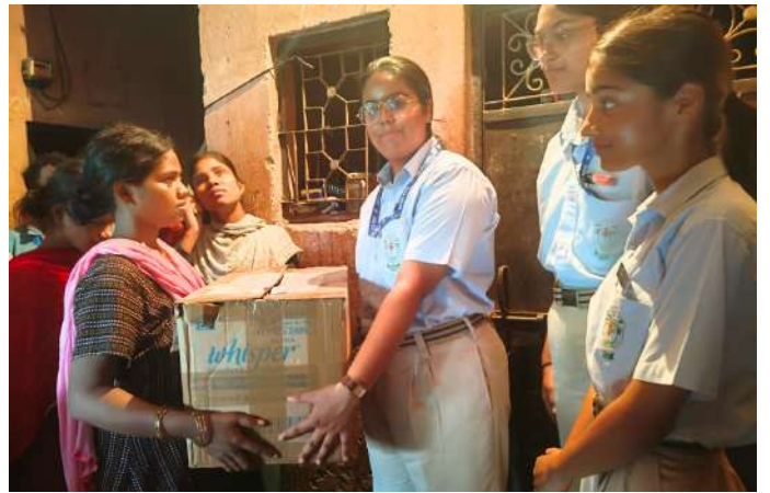
Our rotary students stepping towards kindness and empathy!

At DPSG MRD, we believe in fostering empathy and compassion, shaping a brighter future for all.