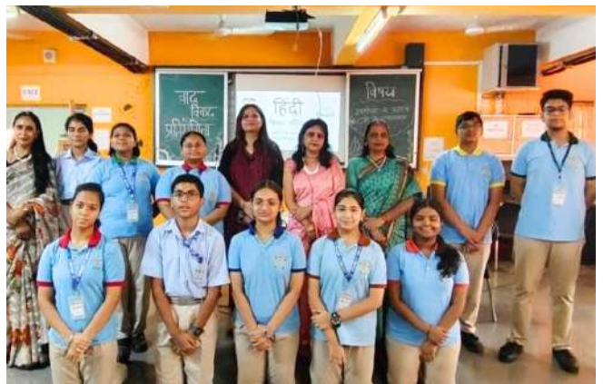
Fostering critical thinking skills and public speaking in young minds!