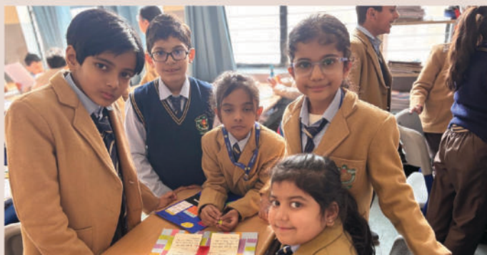
Hands-On Learning, Infinite Possibilities

Ghaziabad: With this spirit, PYP 3 learners brought Maths Week to life through hands-on exploration of geometry. Students designed creative models, interactive board games, visually striking presentations, and informative posters, showcasing angles, shapes, and patterns in action. The activities encouraged collaboration, critical thinking, and practical application of concepts, making learning engaging and meaningful.