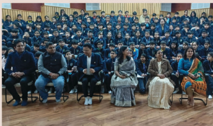
Exploring, Reflecting, and Learning Together