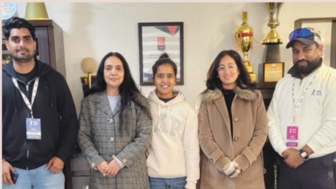
DPSG MR: Empowering Young Women at ground