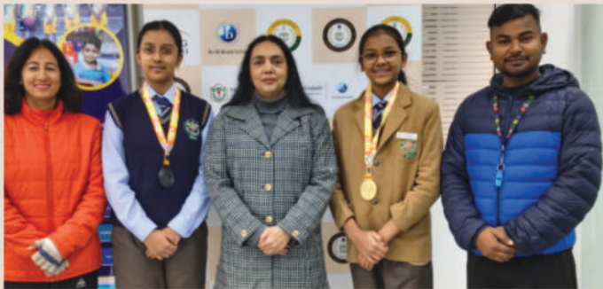
Start Young. Aim high.

Ghaziabad: DPSG MR students delivered an outstanding performance at the 41st Sub-Junior, 9th Cadet & 42nd Senior Kyorugi and 9th Poomsae State Taekwondo Championship 2025, at KD Singh Babu Stadium, Lucknow, showcasing remarkable skill, and sportsmanship. Our athletes showcased the spirit of perseverance and sportsmanship – congratulations to all participants and coaches for bringing honour to the school.