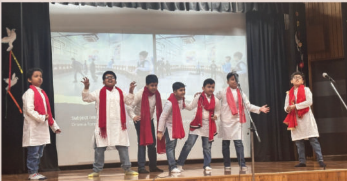
Celebrating curiosity and creativity

Parents were actively involved in quizzes, finding out activity as learning partners in this journey. Students reflected on professions, technology and future skills, demonstrating critical thinking, collaboration, creativity and effective communication, truly celebrating the PYP philosophy of nurturing curious, confident and lifelong learners.