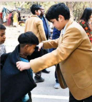
Giving is the greatest gift.

This impactful drive was not merely an act of providing warmth during the winter months, but a powerful lesson in empathy, kindness, and social responsibility. Through active participation, students experienced the true essence of service and understood the importance of giving back to society. Such initiatives play a vital role in shaping socially conscious individuals, reinforcing the belief that education goes far beyond classroom learning and finds its true purpose in creating meaningful, real-world change.