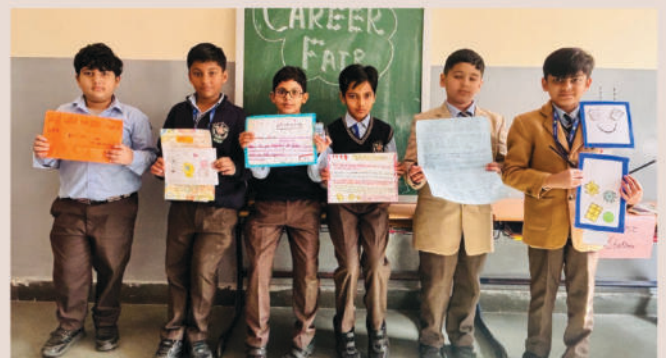
Innovation Meets Aspiration: Exploring Careers

Ghaziabad: Under the theme "How We Organise Ourselves", PYP 3 learners enthusiastically participated in a meticulously curated Career Fair. They delved into diverse and emerging career pathways across Medical, Entertainment, Technology, and Environmental sectors, investigating professional tools, workplace dynamics, key responsibilities, and societal impact.