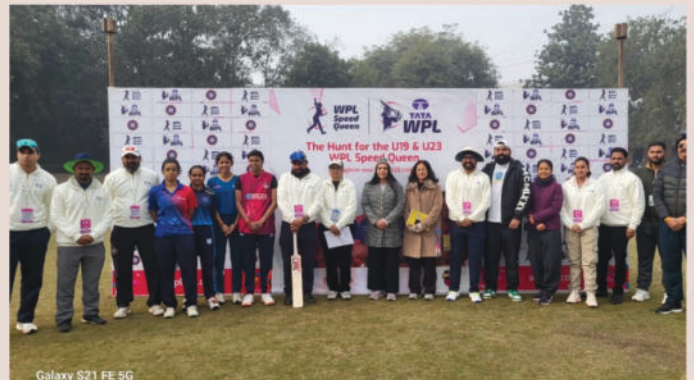
Galaxy S21 FE 5G