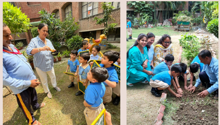
Nurturing responsible young learners at DPSGMR!

Ghaziabad: As part of the 'Van Mahotsav' celebration, our young 'Starz' immersed themselves in a variety of joyful and meaningful engagements. Captivated by tales and rhymes about trees, forests and eco-heroes, they deepened their connection with nature and truly embodied the IB Learner Profile – becoming Young Eco-Warriors who act with impact. With every seed sown, they have also planted the values of environmental stewardship and shared responsibility in alignment with the Sustainable Development Goals.