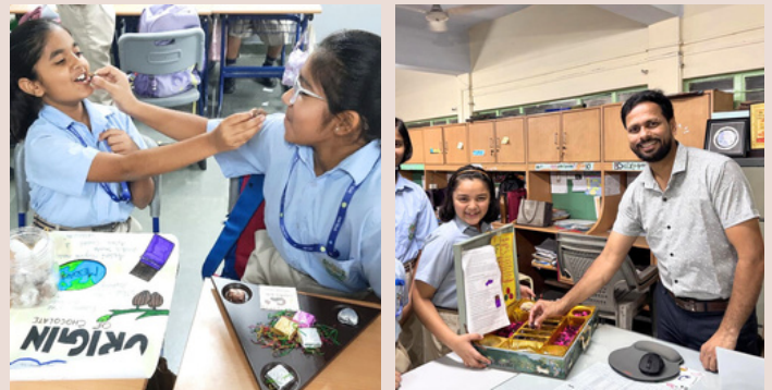
Students share chocolates with joy, embodying the spirit of "Sweet Facts and Shared Treats"

Ghaziabad: On 7th July, the students of the Secondary Wing celebrated World Chocolate Day under the delightful theme "Sweet Facts and Shared Treats." The event witnessed enthusiastic participation and joyful collaboration. As part of the celebration, students researched fascinating facts about chocolate and showcased their findings through vibrant poster presentations. They also shared chocolates with their teachers and friends, turning the day into a truly heartwarming and delicious experience. The event was a perfect blend of learning and fun, leaving everyone with a deeper appreciation for the world's favourite indulgence—chocolate!