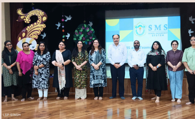
Empowered educators, inspired minds.