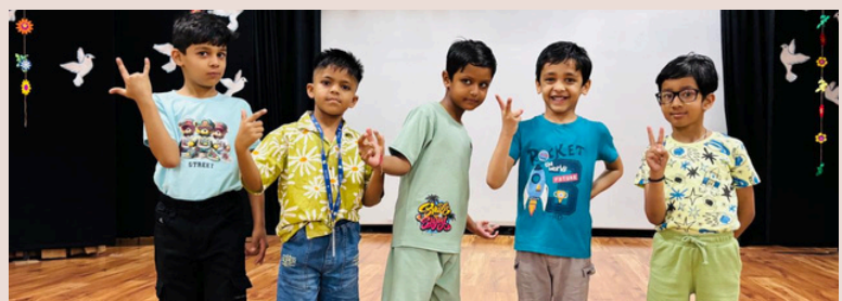
Grade 2 learners shine bright with summer style, smiles, and shared moments of joy.