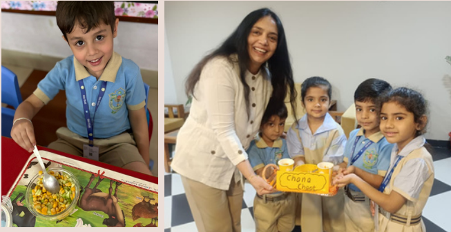
Learning life skills, one chaat bowl at a time!

Ghaziabad: Our kindergarteners had a blast whipping up Chana Chaat and Corn Chaat in a day full of flavours and fun! From chickpeas to corn, cucumbers to lemons, our little chefs explored textures, colours, and tastes while learning about healthy eating. They practiced fine motor skills by mixing, squeezing, and stirring—all while sharing giggles and conversations with friends. These hands-on food adventures weren't just yummy—they were a joyful way to build independence, teamwork, and lasting memories.