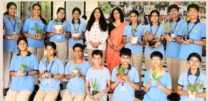
Green gestures of gratitude on Van Mahotsav and Guru Purnima.

Ghaziabad: On 7th July, the students of the Secondary Wing celebrated World Chocolate Day under the delightful theme “Sweet Facts and Shared Treats.” The event witnessed enthusiastic participation and joyful collaboration. As part of the celebration, students researched fascinating facts about chocolate and showcased their findings through vibrant poster presentations. They also shared chocolates with their teachers and friends, turning the day into a truly heartwarming and delicious experience. The event was a perfect blend of learning and fun, leaving everyone with a deeper appreciation for the world’s favourite indulgence—chocolate!