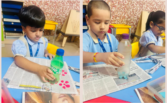
Tiny hands, big impact!

Ghaziabad: Our Nursery learners had a blast making their own paper bags—an engagement that sparked creativity, strengthened fine motor skills and encouraged eco-conscious thinking. By choosing paper over plastic, we are nurturing habits that reduce waste and protect our planet in alignment with the Sustainable Development Goals.