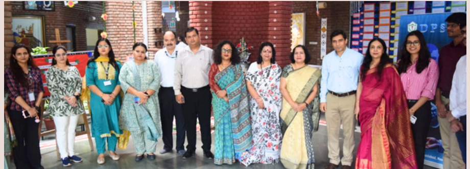
Where Future Tech Leaders Compete, Collaborate, Create

Ghaziabad: The Annual Inter School IT Fest-INFINITUS organised by the school was a celebration of digital brilliance and innovation, bringing together budding minds from 30 esteemed schools across the country. With the theme "AI Beyond Sight: Transforming Dreams into Digital Realities", the fest offered a dynamic platform for students to showcase their technical prowess, creative thinking, and futuristic ideas across a wide array of competitions.