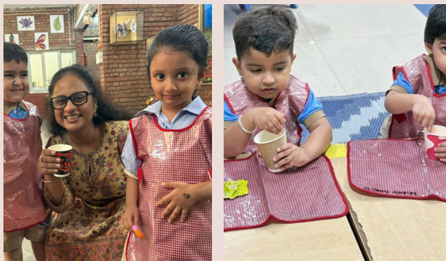
Our little chefs enjoy their Tang treat after a joyful kitchen adventure!

Ghaziabad: Our little Pre-Nursery stars turned into mini chefs during Tang-Making Kitchen Activity. With wide-eyed excitement and tiny helping hands, our learners measured, stirred and poured their way to a refreshing glass of yummy Tang. This hands-on experience was not just delicious—it was a playful way to explore basic concepts like colours, textures, counting and following simple steps. Most of all, it filled our classroom with giggles, joy and a whole lot of flavoured fun.