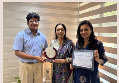
DPSGMR Shines Bright: Wins at the IKTARA 2025 Awards Ceremony