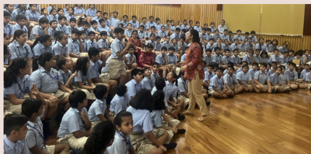
Students lead impactful conversations on self-care and gratitude.