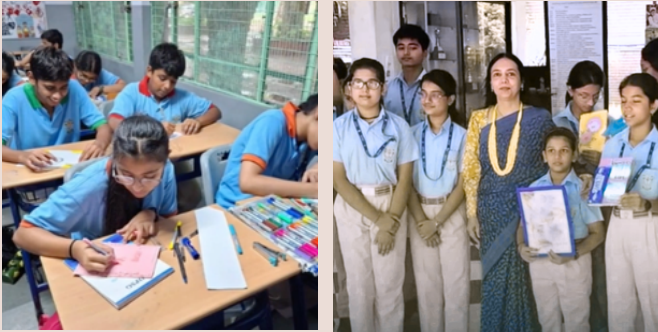
Compassionate and empathetic students of DPSGMR!

Ghaziabad: The Secondary Wing of DPSG Meerut Road celebrated World Forgiveness Day with great enthusiasm and heart. A special session was conducted for students of Grades 8 and 9 to highlight the power and importance of forgiveness in our lives. The event began with an open discussion where students shared personal reflections and powerful quotes, exploring forgiveness as a path to inner peace and emotional balance. Creative activities, such as poster-making and writing forgiveness letters, helped students cultivate empathy, compassion, and self-awareness. The celebration beautifully reinforced the idea that forgiveness isn't just an act—it's a way of life, essential for building a harmonious and peaceful society. Overall, the programme was a meaningful step in nurturing emotional intelligence and character development among students.