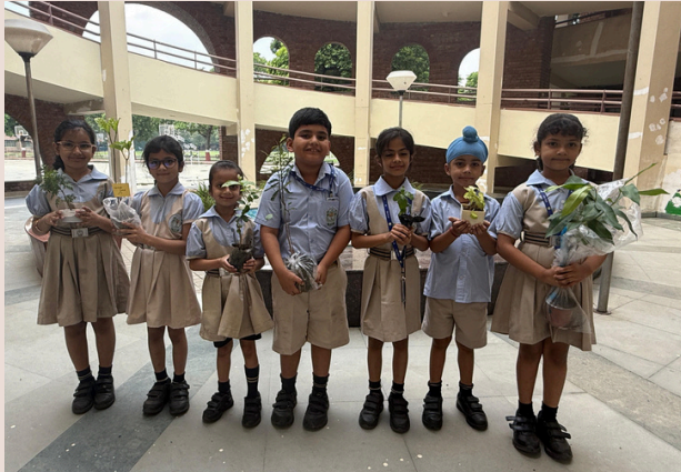
Instilling values of sustainability through tree plantation.

Ghaziabad: DPSG MR's PYP 2 learners celebrated Van Mahotsav by planting saplings brought from home, embracing values of care, sustainability, and environmental responsibility. Their joyful participation reflected a promise to protect nature, showing that small acts, when done together, can create meaningful change.